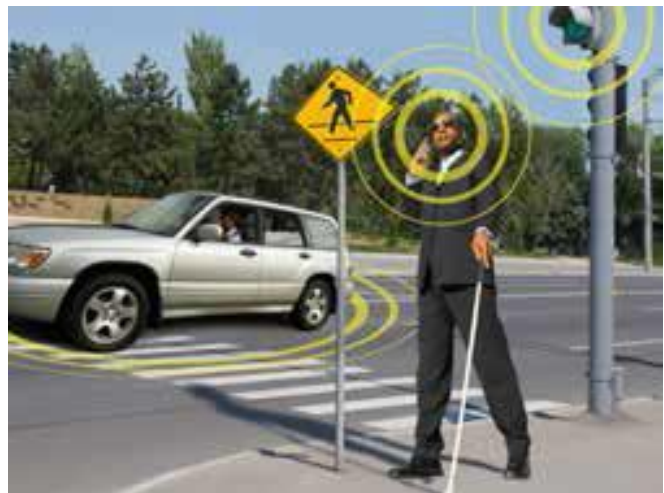
Figure 2: Graphic illustrates continuous communication between a blind pedestrian’s smart phone, traffic signal and automobile.

CV technology will enable cars, trucks, buses, and other vehicles to “talk” to each other, to infrastructure (traffic signals), and with other road users (pedestrians with compatible smartphones, for example) using built-in or add-on devices that continuously share important safety and mobility information. CV technology enables communications among vehicles, infrastructure, and personal communications devices operated by passengers, pedestrians, bicyclists, or other road users.