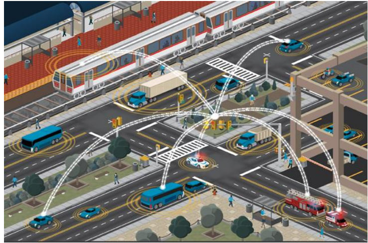
Figure 4: Connected vehicles of all types communicating at a busy intersection.

The benefits of CV technology depend on installation of, and access to, suitable equipment and infrastructure. Such access may be expensive and not uniformly available to EJ populations. Partial deployment of CV technology may leave “blind spots” in the system which could be distributed inequitably, especially with respect to EJ communities. If EJ communities are overlooked as the technology becomes more widespread, then the safety and mobility benefits of the technology may be delayed or denied in those communities, potentially leaving individuals subject to greater accident risks and traffic congestion. If these issues are not addressed during system planning, CVs may have a disproportionately high adverse effect on EJ communities.