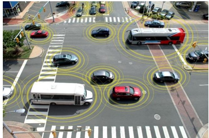
Figure 1: Connected vehicles enable cars to “talk” to one another and this can help to mitigate crashes.

The Federal Highway Administration (FHWA) defines EJ populations as low-income populations or minority populations who will be affected similarly by a proposed program, policy, or other activity funded by FHWA. As policy discussions, planning, and implementation for CVs and vehicle automation proceed, decision-makers should consider equity concerns and pursue policies to ensure that EJ populations do not experience disproportionately high and adverse human health or environmental effects. Adverse effects may include the denial of, reduction in, or significant delay in the receipt of benefits of FHWA programs, policies, or activities (FHWA Order 6640.23A).