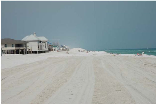
Figure 5. Beach renourishment following a major hurricane.

Distance from the coast is a significant predictor of infrastructure damage (Hatzikyriakou et al., 2016; Walling et al., 2015). A study by Dean (2000) demonstrates that widening a beach, through nourishment, yields storm damage reductions comparable to those of moving infrastructure landward by a similar amount. A number of post-Sandy assessments demonstrate this concept,