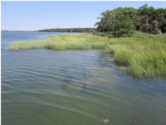
Figure 3. A coastal saltmarsh at mid-tide level.

Marshes reduce storm surge by reducing wave heights, which affect the water level over the marsh, and by slowing the flow of water as it travels across the marsh. No published equations