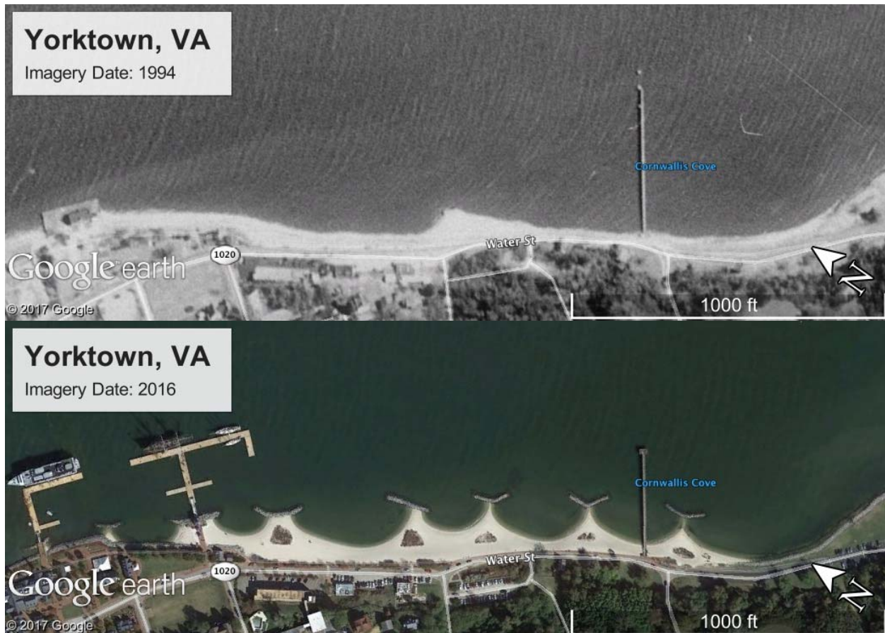
Figure 1. Pocket beaches along Water Street in Yorktown, VA (top panel, 1994; bottom panel, 2016).

The project has performed well by providing protection to the road, and the infrastructure behind the road, while also providing a sandy beach for tourists and locals for over two decades. The beach and vegetation provide intertidal habitat and shore bird habitat. Aside from flooding of Water Street during storms, which has been mitigated by a raised stone wall running parallel to the sidewalk, the road and sidewalks have not sustained damage from coastal storms (Milligan et al., 1996).