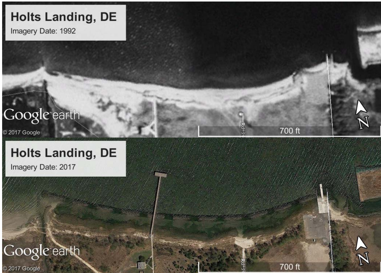
Figure 2. A series of offshore segmented breakwaters are used to attenuate wave energy to protect a constructed saltmarsh at Holts Landing, DE (top panel, 1992; bottom panel, 2017).

In 2005, the State of Delaware, Division of Parks and Recreation, Department of Natural Resources and Environmental Control (DNREC) built the offshore breakwaters in lieu of a bulkhead with the goal of creating wetland habitat while stabilizing the shoreline. The project protects approximately 1,000 feet of intertidal shoreline located 4 miles southwest of the Indian River Inlet. The offshore segmented breakwaters also attenuate wave energy when wind blows along the fetches, which vary from 2 miles to 4 miles. Pre- and post-construction photos are shown in Figure 2.