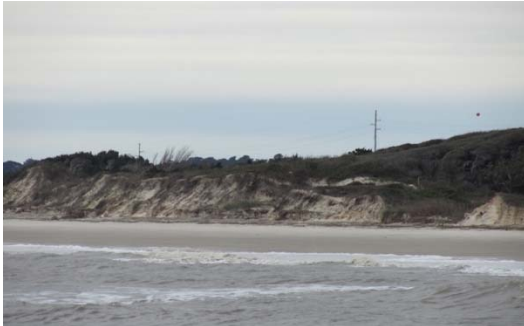
Figure 6. These large sand dunes are eroding due to shoreline retreat.

to storm return period which can be used in the design of dunes. Though the equation is known to contain considerable uncertainty, it was developed for and is still used by FEMA to determine the limit of wave action on coastal flood maps. Dune erosion during a major storm can remove all the wave protection afforded by a small dune. This tool was developed to define how large a