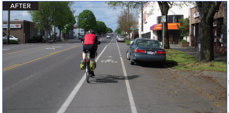
Road Diet on Stone Way, Seattle, WA