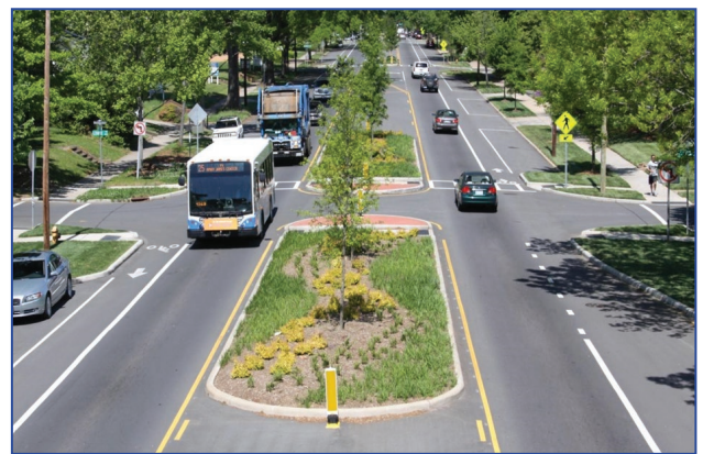
Road Diet on East Boulevard, Charlotte, NC