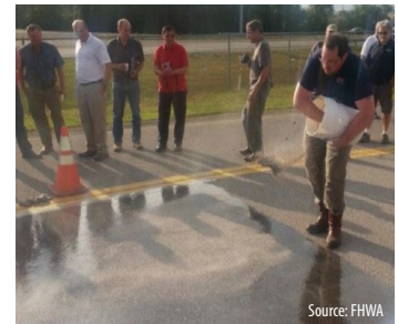
HFST Open House by TDOT

Additionally, TDOT held an "open house" event in 2015, as seen in photo, where they provided nearly 50 participants representing local agencies, engineering consultants, TDOT, FHWA, and universities with an opportunity to learn more about HFST application, benefits, and costs. The event included a live, on-site demonstration of HFST installation by the TDOT Materials and Test Division; presentations on HFST history, development, effectiveness, and installation; and an opportunity for questions and answers with TDOT and FHWA presenters.