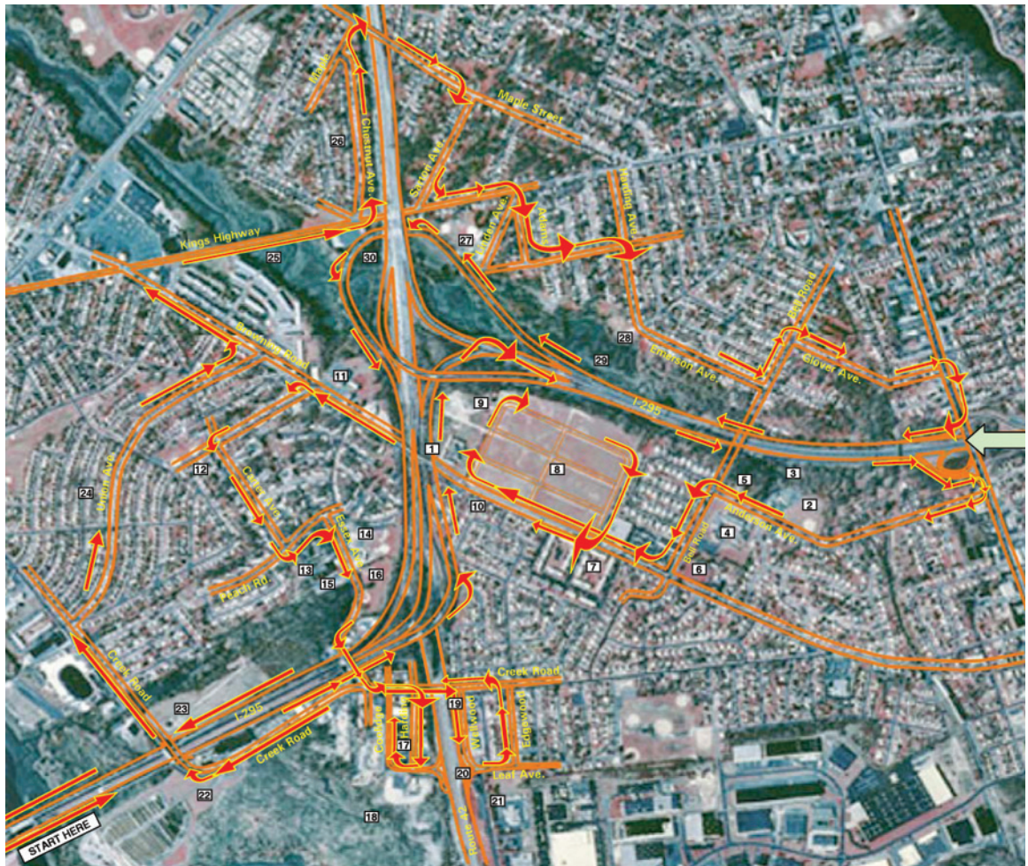
Figure 1. Map of project area.