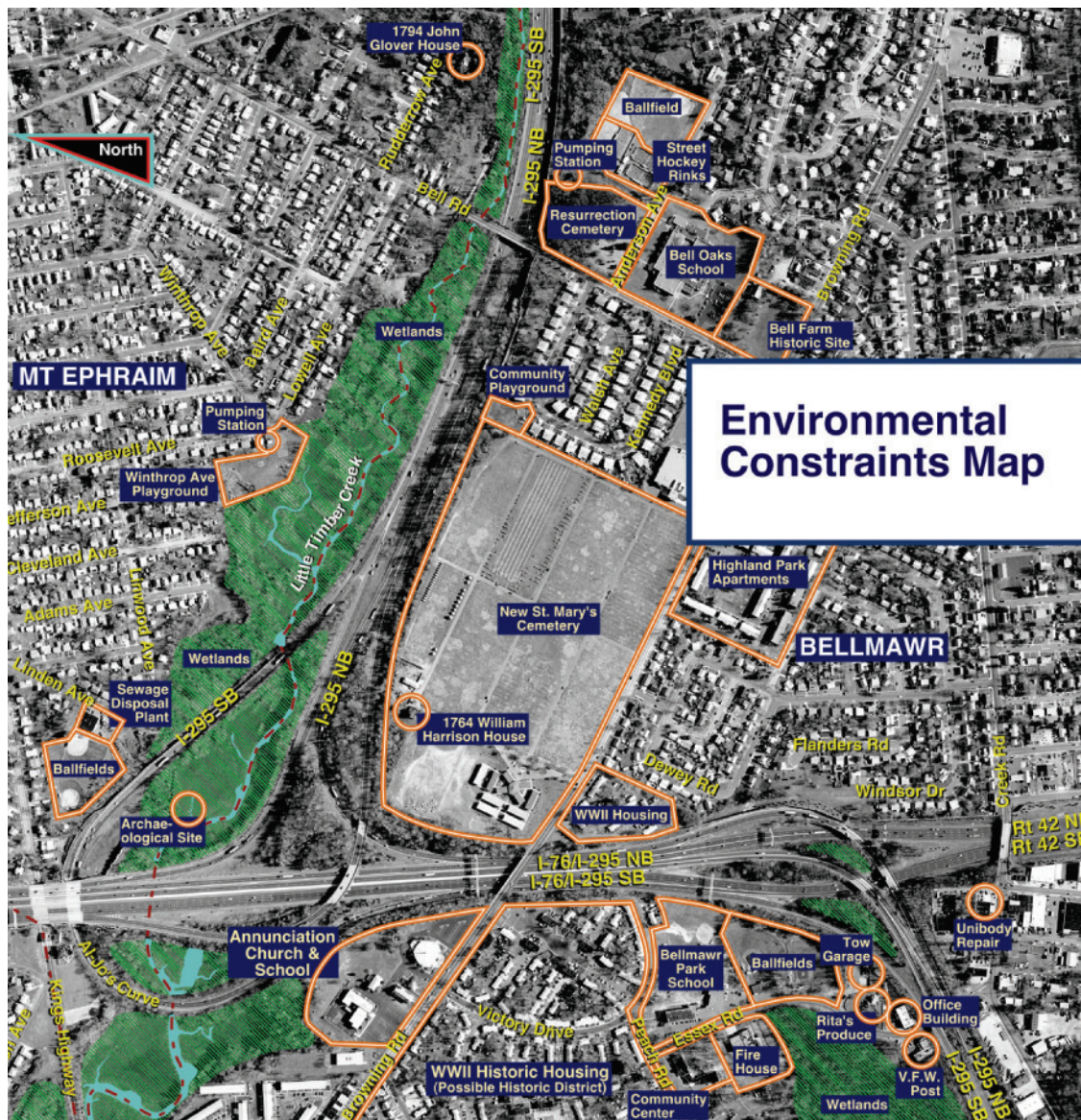
Figure 2. Map of project area.