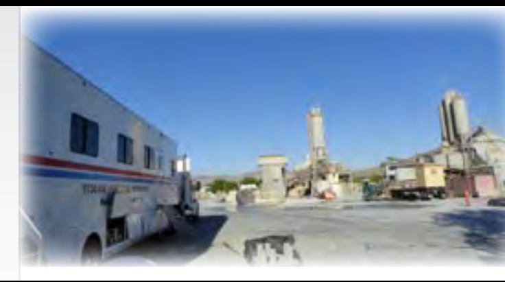
Transferring Advanced Concrete Technology To Our Partners