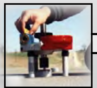
Tensile bond strength testing of a bonded over asphalt overlay

The MCL accomplishes its goal of technology deployment through project participation, demonstrations, training, and equipment loan. In an effort to reach a maximum number of transportation personnel with significant project findings, evaluation results, and innovative concrete technologies, the MCL provides project reports and published papers in journals and symposia proceedings. Presentations at industry conferences and showcases, such as ACI, PCI, ACPA, and TRB are utilized to further the transfer of these new technologies. MCL staff can also provide speakers, put on specialized workshops, and provide technical assistance.