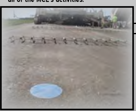
Setup for nondestructive pavement thickness measurement on US30 in lowa.

Device to nondestructively measure pavement thickness.