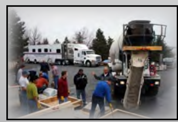
NHI training course