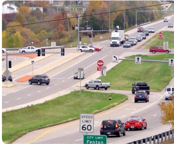
Fenton, MO DLT Intersection Source: DLT Video FHWA-SA-14-021