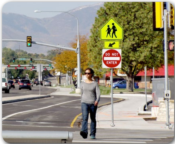
Salt Lake City, UT DLT Intersection

A DLT also can support community goals for pedestrians and bicycles. Provisions for walking and biking must be considered throughout the project development process, with the needs of pedestrians and bicycles shaping the overall design of the DLT accordingly. This includes pedestrian crossings that are accessible to all users, and traffic signal phases that accommodate both pedestrians and bicycles.