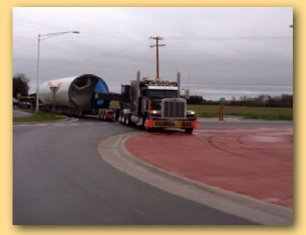
Figure 1: Oversize truck entering a roundabout designed to accommodate OSOW vehicles.