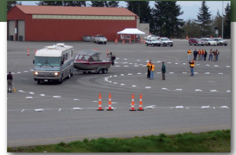
Figure 2: WSDOT sets up a mock driveable roundabout to help drivers learn how to navigate the design.

roundabout as a motorist, pedestrian, and cyclist, and why roundabouts are so much safer than traditional signalized and stop-controlled intersections. DVDs of the video and hard copies of the brochure are available in all county libraries and have also been distributed to driver training programs across the State. The brochures are also available online for download and are distributed at WSDOT open-house events.