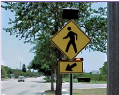
Figure 2: Activated, solar-powered, roadside RRFB at a mid-block crosswalk