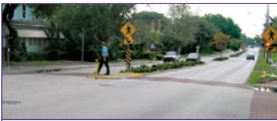
Figure 3: Combined roadside and median system of solar-powered RRFB