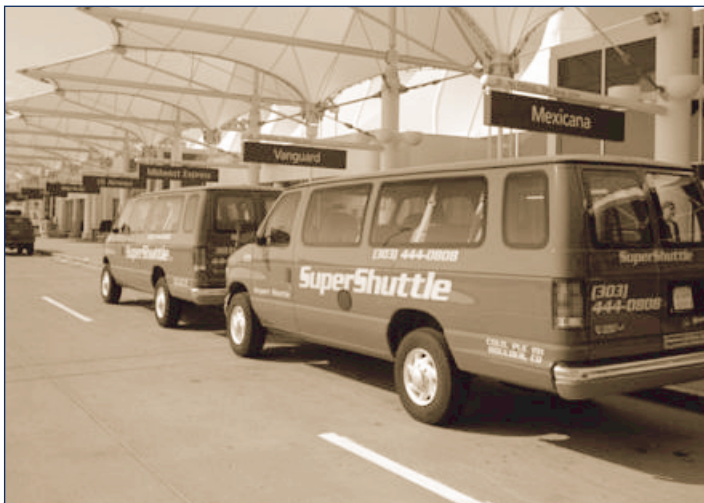
Airport shuttles make excellent candidates for AFVs because of the centralized nature of their operations.

According to the fact sheet, motor vehicles are the single largest source of pollution at airports—exceeding even aircraft. Because airports are required to comply with local air quality plans and airport fleets are uniquely suited to AFV use, airports offer attractive opportunities for the expanded use of AFVs. Airport case studies at Boston Logan International Airport, Denver International Airport, and Los Angeles International Airport provide details on experiences and lessons learned.