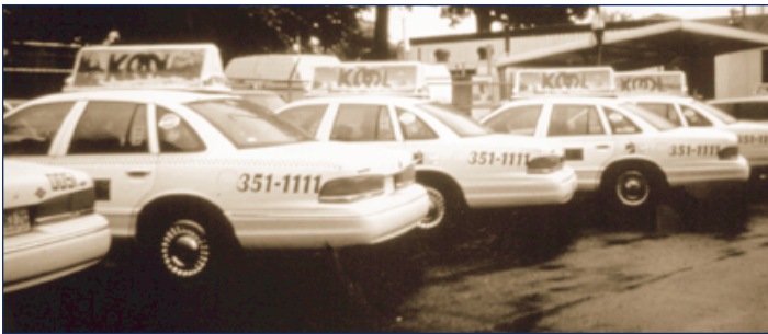
Atlanta's Checker Cab Company has more than 70 AFVs, representing 40% of its fleet.

Clean Cities-Atlanta stakeholder, Checker Cab Company, received a Merit Award from the U.S. Environmental Protection Agency on October 19, 2000. The award recognizes the company's leadership and dedication to environmental protection. Checker Cab started its alternative fuel vehicle (AFV) effort in 1996 with a fleet of 20 natural gas cabs. Since then the fleet has grown to more than 70 AFVs (40% of its fleet), including natural gas and electric vehicles. Checker Cab also houses two fueling locations that anchor the Atlanta FuelNet system, which allows access to anyone carrying a FuelNet card. A true Clean Cities champion, Checker Cab continues to work with its partners, Atlanta Gas Light, Ford Motor Company, and FuelMaker Corporation, to help establish an AFV market foundation in Atlanta.