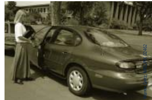
The AFV resale market is an emerging opportunity for both fleet purchases and private individuals.

in a special section of its Web site. NGVC's market exchange, located at www.ngvc.org/mktxch.html , typically features seven to ten vehicles at one time. "People have found the site to be a viable medium for selling vehicles," said NGVC's David Steele, Director of Communications and Member Services.