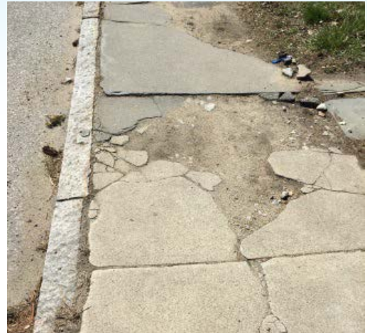
Figure 4: Poor sidewalk conditions along Williams Street, RSA location on Mohegan Avenue Parkway (Route 32) in New London, CT.

CTDOT must be flexible in its approach to the RSAs, as each town is unique and has different safety concerns and preferred solutions for local urban, suburban, and rural contexts. Solutions that may work in urban areas may not be applicable to rural areas. For example, traffic calming solutions such as a “road diet” may work well in urban areas, while roundabouts may be more appropriate in suburban or rural areas.