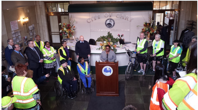
Figure 8: Mayor Karen Freeman-Wilson welcomes participants and press to the USDOT Pedestrian and Bicycle Road Safety Assessment in Gary, IN.

In 2015, the Federal Highway Administration's (FHWA) Indiana Division met with Mayor Freeman-Wilson to invite the city to participate in the U.S. Department of Transportation's (USDOT) Pedestrian and Bicyclist Road Safety Assessments . Building upon Gary's designation in 2014 as a Strong Cities, Strong Communities (SC2) location, FHWA partnered with the U.S. Environmental Protection Agency (EPA) Region V, the U.S. Department of Housing and Urban Development (HUD) Region V Office, the Northwest Indiana Regional Planning Commission, and the city of Gary, as well as the Federal Transit Administration (FTA), Federal Railroad Administration (FRA), National Highway Traffic Safety Administration (NHTSA), and the Federal Motor Carrier Safety Administration (FMCSA). In addition to the Federal agencies, several other regional and State agencies, as well as groups advocating for bicyclists, pedestrians, and persons with disabilities participated in the assessment.