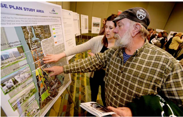
Figure 7: Baton Rouge community member participating in the planning and development of the new streetcar line in Baton Rouge, LA.

sudden we were getting unanimous community acceptance of [the project]. There are many schools along the extension, and we were able to communicate how the project will affect those schools. When you talk about [the project] in that perspective, business owners get really excited about it too." Now, conversations surrounding the light rail project regularly focus on accessibility and opportunity, and key project partners now have greater awareness regarding where highway projects may overlap with transit and pedestrian projects.