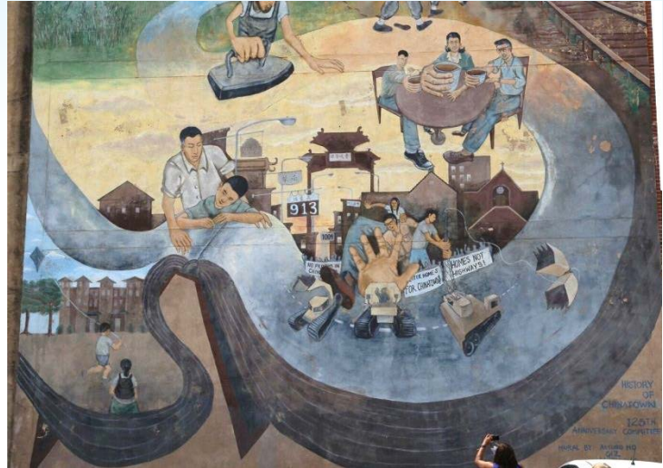
Figure 2: "History of Chinatown," by Arturo Ho depicts the struggle against urban renewal in the late 1960s when construction of the Philadelphia Vine Street Expressway bifurcated the community.

The Vine Street Expressway (I-676) was built 25 years ago to connect I-95 at Philadelphia's eastern edge with I-76, dividing the city's Chinatown and Callowhill neighborhoods. Residents were able to reimagine a Vine Street Corridor that improves neighborhood connections, creates equitable mixed-use development opportunities, and provides inclusive mobility options. Participants developed short- and medium-term ideas such as traffic calming, street redesign, adding to the network of green space, and making bridges and underpasses more hospitable to people, pedestrians, and bicyclists.