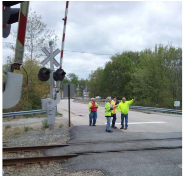
Figure 3: Railroad Crossing on Main Street, RSA Location on Riverside Drive (Route 12) and Main Street in Thompson, CT.

CTDOT uses a consultant to help municipalities administer the RSAs, with CTDOT staff from the Intermodal Planning and Traffic divisions participating in each RSA.