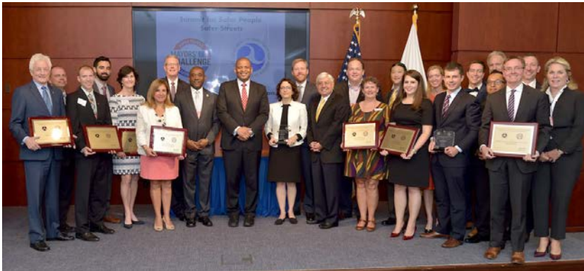
Figure 9: Secretary of Transportation Anthony Foxx with award recipients at the Safer People, Safer Streets Summit.