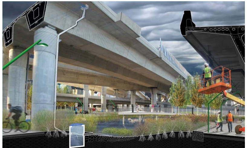
Figure 10: Rendering image by Landing Studio of I-93 Overpass improvements.

Under this program, MassDOT is planning a $6 million pilot project in Boston's South End for the area under the I-93 overpass. During the first phase, artistic lighting was installed, sidewalk improvements were made, and two parking lots were constructed beneath I-93. The second phase will include a new multimodal path, sports facilities, a stormwater management system, a concert stage, and a dog park, all underneath the highway overpass.