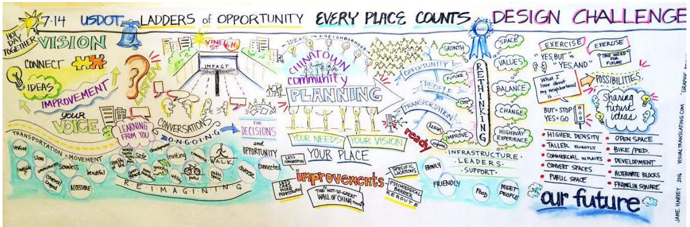
Figure 1: Graphic illustration of Every Place Counts Philadelphia.

As part of the Ladders of Opportunity initiative, the U.S. Department of Transportation (USDOT) Office of the Secretary launched the Every Place Counts Design Challenge in May 2016. The Challenge set out to raise awareness and identify inclusive community design solutions that bridge the infrastructure divide and reconnect people to opportunity. It empowered communities and decisionmakers to work together to develop context-sensitive design solutions that reflect and incorporate the input of the people and communities they impact.