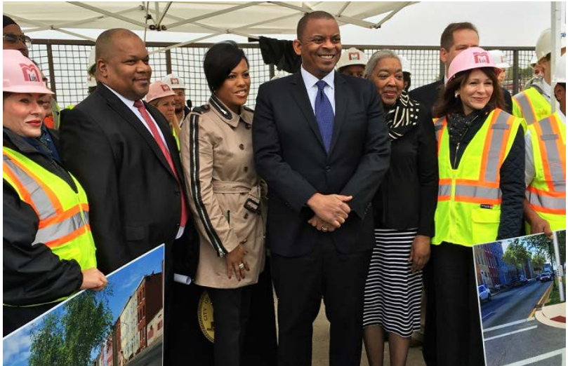
Figure 6: Stephanie Rawlings-Blake, mayor of Baltimore, and Secretary of Transportation Anthony Foxx at the groundbreaking of the reconnect West Baltimore Project.

The convening power of the Federal government led to new investments and partnerships in several LadderS TEP communities. For example, in Baltimore , interagency collaboration at the local and Federal levels alleviated private investor concerns to advance a neighborhood revitalization project near the West Baltimore Marc Station. In Atlanta , LadderS TEP provided the platform for USDOT to explore priority issues in the area. City and Federal staff formed new strategic