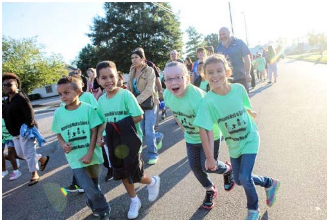
Figure 12: Students celebrate a Walk to School Day event at Tanglewood Elementary School in Lumberton, NC.

Including local officials in these events gives them a chance to see needed safety improvements firsthand, such as new sidewalks, crosswalks, or trails. Involving officials may encourage them to push safety projects forward. Walk and Bike to School events also provide a way for officials to demonstrate their support for safety, health, community quality of life, and protecting the environment. In 2015, Michael Nutter, mayor of Philadelphia participated in an event as a way to bring attention to pedestrian safety in his city. He said, "We need to make sure that those of us who drive vehicles do so in a responsible way, especially in neighborhoods and near school and recreation center buildings, so that everyone has a safe environment in which to walk."