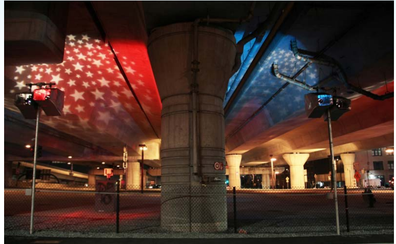
Figure 11: Ornamental lighting under I-93 Overpass.

These efforts serve as inspiring examples of how highway infrastructure can enhance livability through thoughtful design and infrastructure adaptations. While highways have always improved vehicular mobility, these projects show how existing infrastructure can be maximized to build thriving public spaces that promote accessibility for pedestrians, bicyclists, and cars. These examples and similar projects around the country create opportunities for communities to reconnect through recreation, mobility, and economic activity.