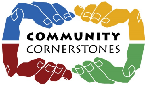
Figure 4: Community Cornerstones logo.

Inclusive and culturally competent engagement forms the foundation for strong lines of communication and trust between the program's institutional partners and historically underrepresented communities. Trusted leaders in these communities engaged with their constituents to form the Multicultural Coalition, which is comprised of twelve immigrant- and refugee-serving community organizations. The Coalition is planning for a shared multi-cultural center. Over 700 participants engaged in five large community events in nine different languages to plan for the multicultural center . The coalition is committed to staying together to formalize its structure and to share programming, resources, and space.