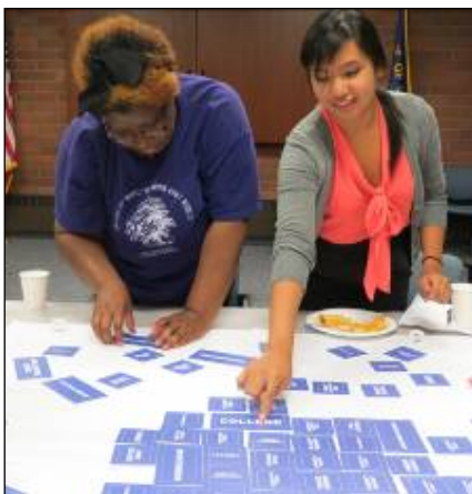
Figure 8: Community members playing the Built Game.

To engage a broad audience, the project team developed a number of unique tools. One such tool " Meetings in a Box " offered English- and Spanish-speaking community members the opportunity to host discussions on their own time with friends and neighbors regarding community issues. Following these discussions, hosts returned comment cards, maps, and other relevant information to the study team.