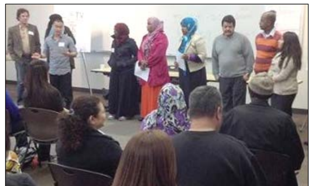
Figure 11: Aloha Unite meeting presentation.

The CAC and community members ensured the benefits and burdens of the study's final recommendations were shared equitably, to the extent possible. The project team coordinated project outcomes with other local, county-wide, and regional planning efforts by communicating, planning, and implementing efforts together. The result is a final plan that describes the goals,