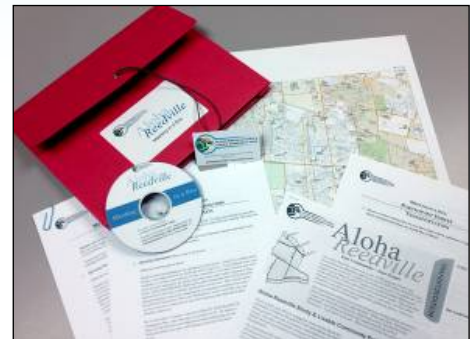
Figure 7: Materials from meeting in a box.

The population in the Aloha-Reedville region, which totals more than 50,000 residents, is younger, earns less, has a higher poverty rate, and is more cost-burdened for housing and transportation on average than the rest of the county. To address these trends, the study focused on strategies that would enhance and improve housing conditions, redevelopment opportunities (both public and private), and transportation facilities.