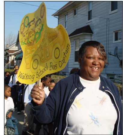
Figure 6: Walking school bus at Louisa May Alcott Elementary School in Cleveland.

The Creating Healthy Communities Program (CHC) at ODH funds active living strategies to increase physical activity and reduce the risk of chronic disease for Ohioans in 23 counties. These strategies include HIAs, Safe Routes to School, multi-use trails, active transportation plans, and Complete Streets policy development. The Summit County CHC program, for example, partnered with local transportation officials and the school district to install a community walking trail in Springfield Township. In 2015, the township will have exercise stations and benches added to the trail, and the exercise stations will be incorporated into Springfield Township students’ physical education classes.