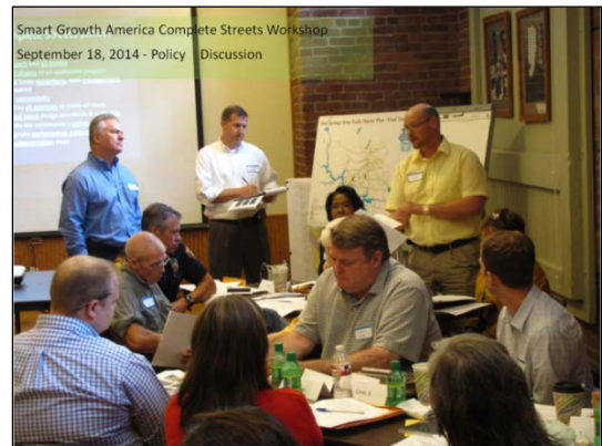
Figure 2: Complete Streets Policy discussion.