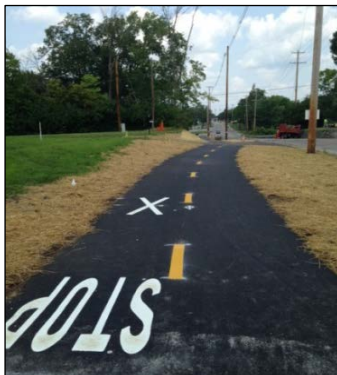
Figure 5: Walking trail.

Advocacy groups also play an important role by creating a forum where the health and transportation sectors can meet, develop relationships, and identify commonalities. The Ohio Safe Routes Network , established by the SRTSNP through a Robert Wood Johnson Foundation grant, has over 400 members who represent transportation, health, education, government, and community sectors. The network partnered with the Ohio YMCA to develop and deliver a series of active transportation training programs that incorporate active transportation planning and policy into the community planning process.