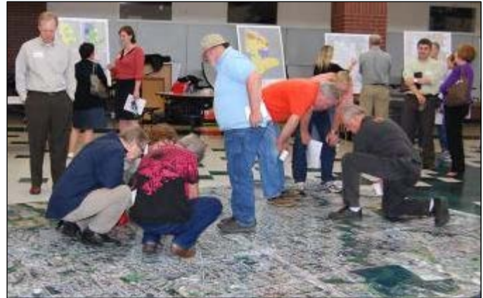
Figure 10: Community members discuss plans using a study area floor map.

The planning effort placed a great deal of emphasis on involvement by historically underrepresented communities. The Center for Intercultural Organizing (CIO), a regional advocacy firm, created a cohort of nonprofits that serve many immigrants and communities of color in the county and region. The cohort, called Aloha Unite , comprised five nonprofits that contacted more than 1,200 community members and collected more than 600 surveys. The work of CIO and Aloha Unite provided county organizations, including recently elected leadership, insight into the perspectives of traditionally underrepresented communities.