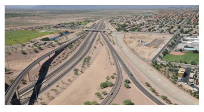
Rendering of the completed South Mountain Freeway Project

Due to the preferred alternative's proximity to South Mountain Park, which is a resource having afforded protection under Section 4(f), historical, cultural, and recreational significance, as well as other community