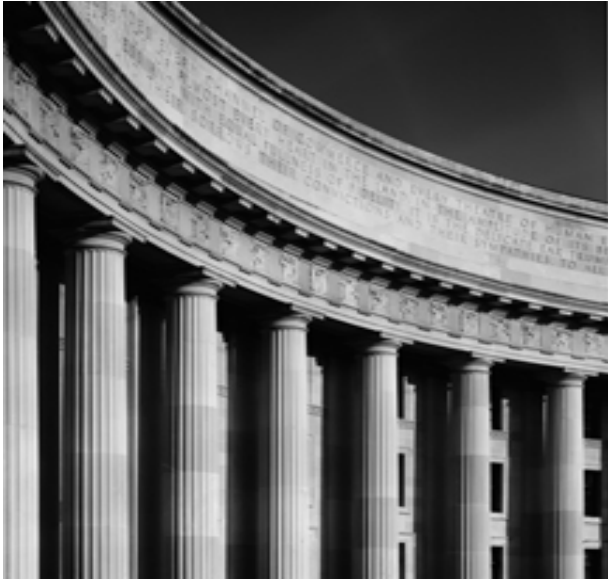
The exterior of the Ariel Rios Building