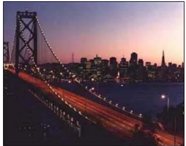
Policy changes, such as the historic preservation exemption featured in The Interstate Highway System Section 106 Exemption: Maintaining a Unique Resource (May 2005), continue to change the landscape of transportation and the environment. Pictured above is the western span of the San Francisco-Oakland Bay Bridge, which will still be subject to Section 106 of the National Historic Preservation Act under the new Historic Preservation Exemption for the Interstate Highway System.