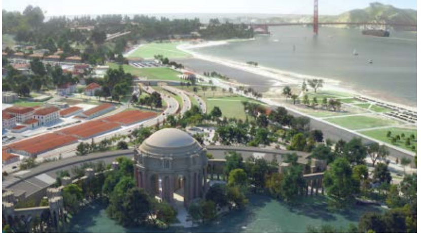
This image is a rendering of the selected alternative for the Presidio Parkway project in San Francisco, California.

Presidio Parkway Project: This project illustrates CSS's cost effectiveness and streamlining benefits. The Presidio Parkway project will reconstruct a six-lane section of Highway 101 that connects the city of San Francisco to the Golden Gate Bridge. Through continuous engagement of diverse stakeholders, the California Department of Transportation (Caltrans) resolved a decades-long project stalemate related to issues such as noise, environmental impacts, and the historic value of adjacent communities. Reaching consensus among the stakeholders, Caltrans was able to address the factors that were delaying the project and move it into construction. Incorporating CSS through consensus building and preserving and enhancing community and natural environments proved to significantly reduce costs by accelerating project delivery.