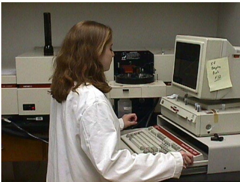
Figure 4. Graphite Furnace Atomic Absorption Spectrometer

The graphite furnace technique was used to determine the concentration of metals in liquids when low concentrations are necessary. A single standard was made that the autosampler uses to mix the calibration points. Samples were loaded into 2-mL sample cups in the autosampler. The autosampler extracts the sample and injects the sample into the graphite tube. Two graphite tubes, partition tube and the plateau tube, were used to perform the analysis and the type of tube used depends on the furnace parameters and method performed. In this project, the partition tube was used most frequently and the furnace parameters are set up to Varian's specifications. For cadmium and thallium, a plateau tube was used to because of difficulties from using the partition tube. For these metals, the furnace parameters were set up as described in a paper published by Varian (Beach, 1988) or their manual for graphite tube atomizers (Rothery, 1988).