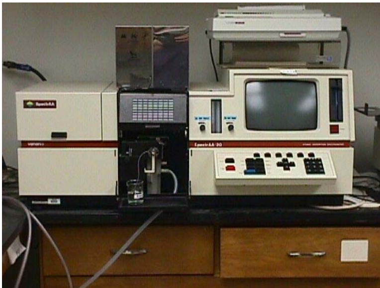
Figure 3. Flame Atomic Absorption Spectrometer

The machine detection limits were used to determine which machine would be appropriate to use to for testing each metal. The metals analyzed using direct-aspiration atomic absorption spectrometry were aluminum, barium, copper, manganese, silver, and zinc. Barium and aluminum required the addition of potassium chloride to the metal digestion (Method 3010) (US EPA, 1999) to reduce interferences from other metals in the sample. The resultant potassium chloride concentration was 2000 mg/L.