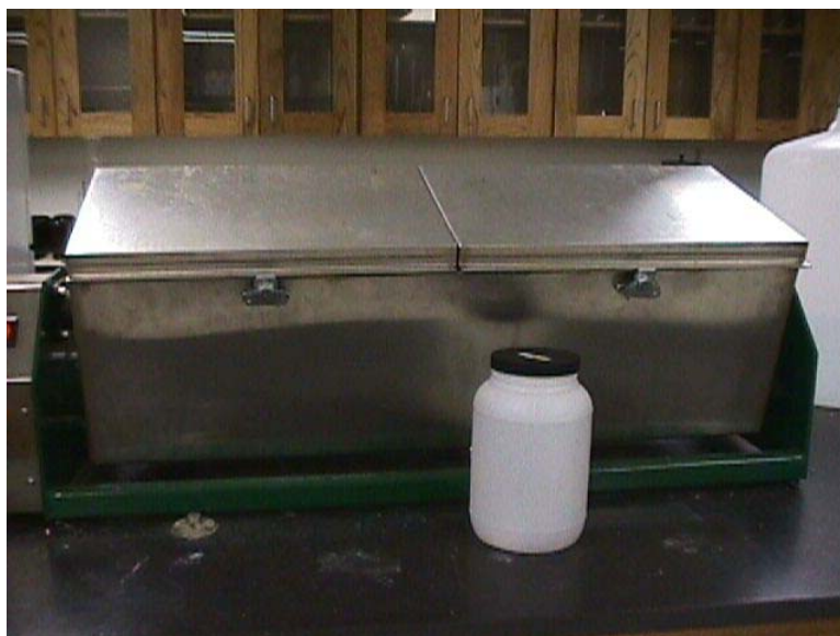
Figure 1. Extraction vessel and tumbler