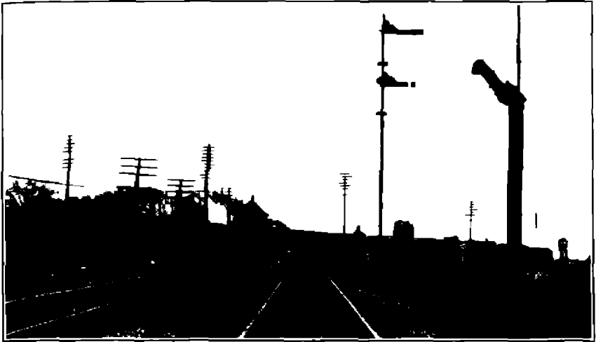
FIG. 3.—Signal 35—New York Central train on crossing

The engine of train No 151 struck the first coach of train No 20 in the center carrying it for a considerable distance to the west and entirely demolishing it—it was in this coach that nearly all of the