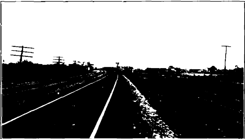
FIG. 2.—View of signal 35 had by Michigan Central engineman

passed Otis, the last reporting station, 8.8 miles east of Porter, at 6:12 p. m., 2 minutes late, and while running at a speed estimated to have been 50 miles an hour, collided at 6:22 p. m. with Michigan Cen-