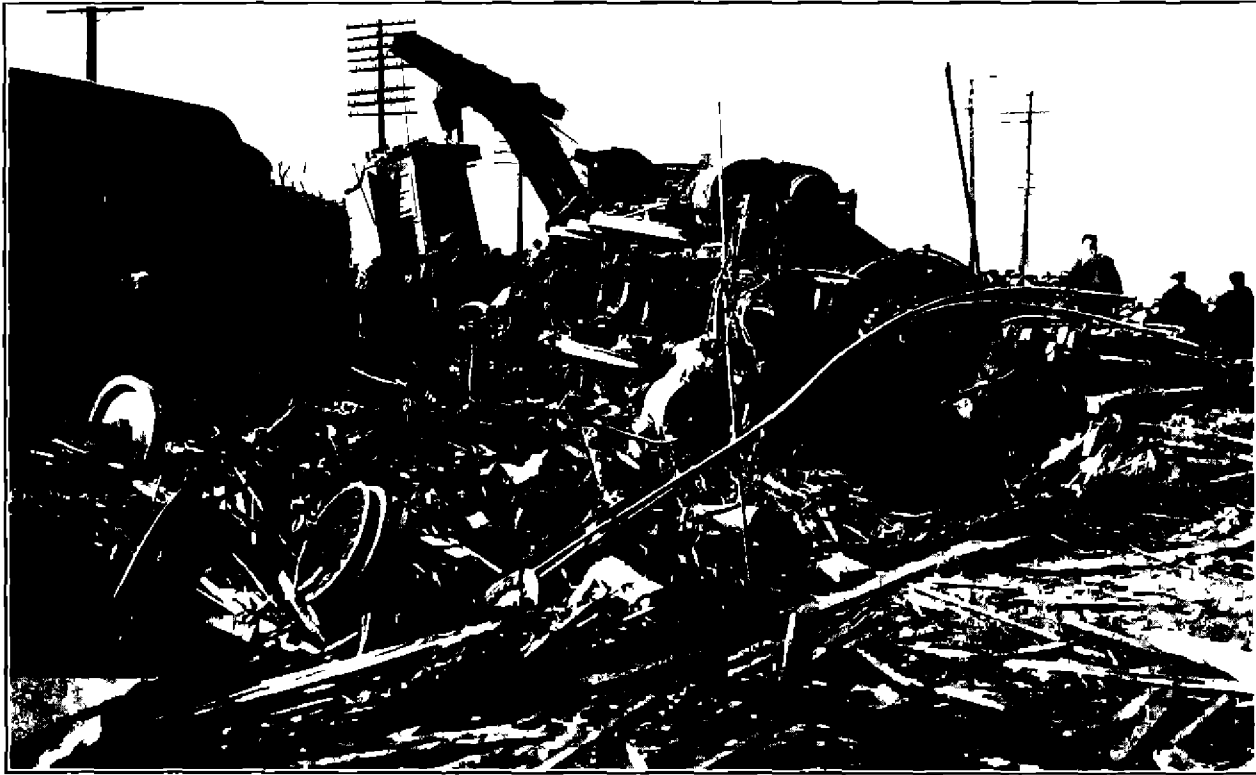
FIG. 6—New York Central engine 4828 west of interlocking tower