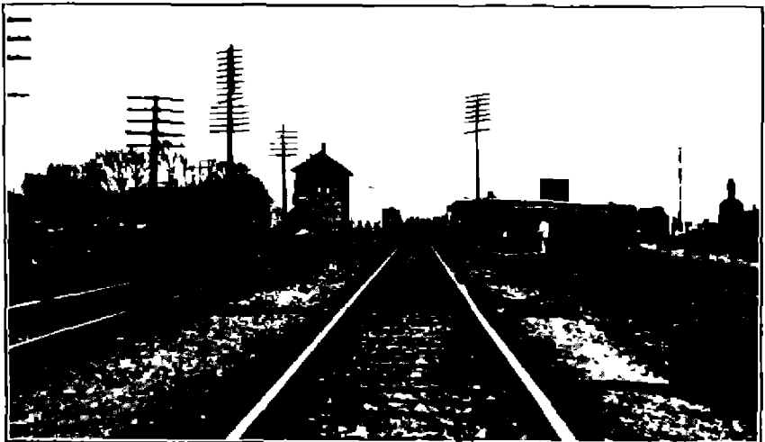
FIG. 4.—Drift east of signal 35

fatalities and injuries occurred. Engine 4828 was turned completely around and came to rest on its left side, partially buried in the ground about 75 feet west of the crossing and a few feet north of