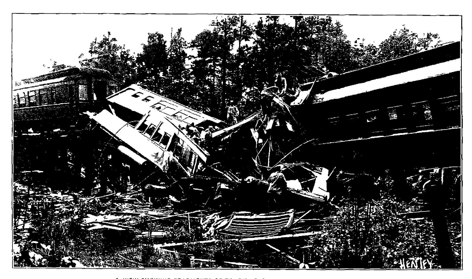
2 VIEW SHOWING FRAGMENTS OF TOURIST SLEEPING CARS NOS 1302 AND 1161