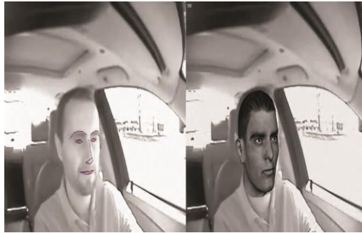
As part of a video analytics project, researchers developed an identity masking system to replace a driver's face in a video with an avatar's face for identity protection.

FHWA recently published the catalog, “EAR Program Research Results—Updated Through 2016” (FHWA-HRT-17-021), which documents research results through 2016.