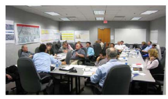
A workshop was held to generate ideas and action items for the PSAP.

To kick off the project, the Florida Department of Transportation hosted a day-long workshop with representatives from the law enforcement, schools, planning agencies, and public works departments. The workshop will be followed up by more tailored meetings with stakeholders--both those attending the workshop and others. The resulting PSAP will provide a blueprint for the implementation of pedestrian improvements throughout the county. Pinellas County is currently working on its plan as well.