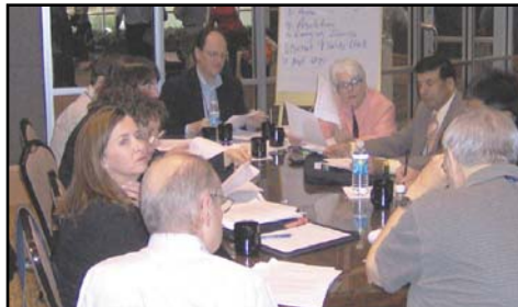
A group discussion that took place at the meeting.

The first annual meeting of the American Association of State Highway and Transportation Officials (AASHTO) Standing Committee on Highway Traffic Safety - Subcommittee on Safety Management (SCOHTS-SM) was held on September 20-22 in Oklahoma City, Oklahoma. 112 highway safety practitioners from federal, state agencies and the private sector convened to initiate facilitation and implementation of multidisciplinary safety strategies in each state that will advance efforts toward reducing highway injuries and fatalities. 42 states were represented at the meeting.