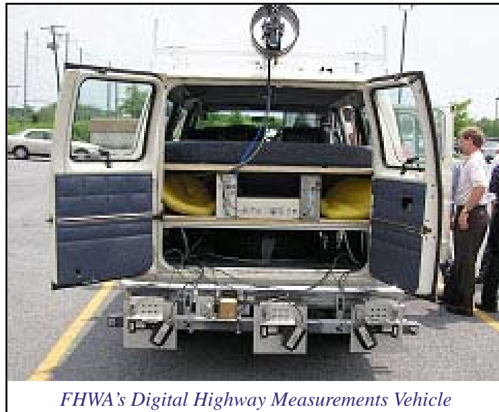
FHWA's Digital Highway Measurements Vehicle

The FHWA staff at Turner-Fairbank Highway Research Center (TFHRC) worked with the Pennsylvania Department of Transportation (PennDOT) to conduct a two-phased effort aimed at understanding how varying pavement marking treatments affect driver performance. The first phase involved experiments with driving subjects in the FHWA's instrumented field research vehicle. The second phase involved replicating the field experiments in the highway driving simulator (HDS) at TFHRC. PennDOT made a section of rural, two-lane road available for nighttime test runs and provided a contractor to apply the various pavement marking treatments over a three week period.