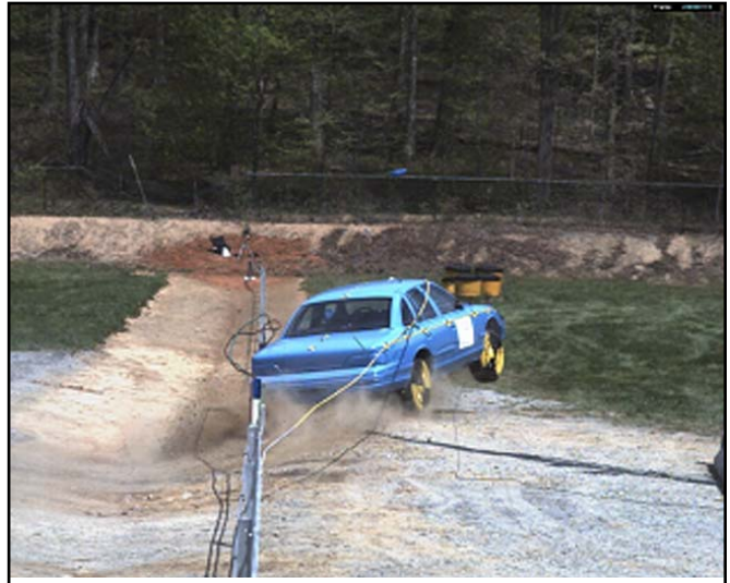
Crash Test striking a North Carolina cable median barrier

Two full-scale crash tests were performed at the FOIL to confirm the simulation findings. The tests involved a Ford Crown Victoria sedan striking a North Carolina cable median barrier