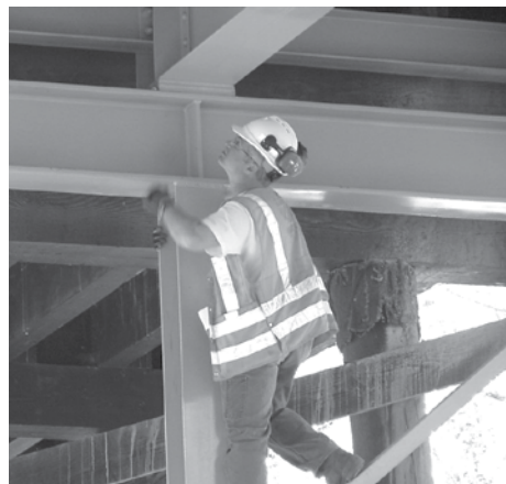
Top right: A visual inspection of a steel girder bridge is conducted. Middle right: An inspector conducts a visual inspection of a truss structure. Bottom right: An under-bridge inspection vehicle is used on an Interstate bridge. Bottom left: A visual inspection is carried out for a steel substructure unit.