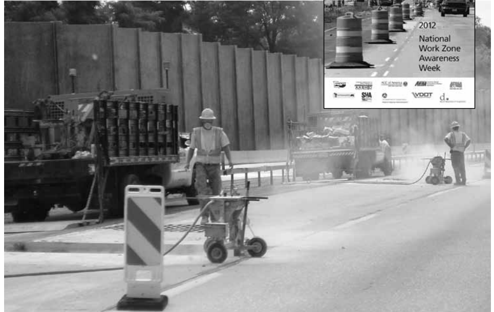
States across the country will kick off National Work Zone Awareness Week 2012 on April 23. Education and outreach campaigns stress the importance of protecting both workers and motorists.