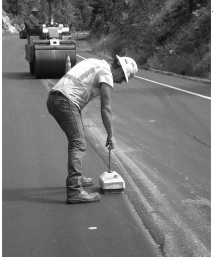
A new FHWA workshop highlights the latest information on specifying and constructing more durable longitudinal asphalt pavement joints.

tor makes a straight first pass. Other important best practices include ensuring that the vibratory screed on the paver is turned on at all times during construction and applying a tack coat uniformly to the full width of the lane.