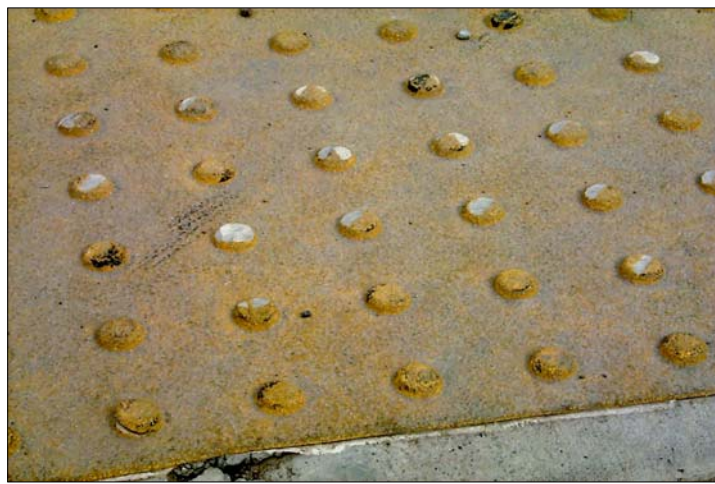
Installation 7 : Close-up of damaged mat. Loss of domes and torn surface.