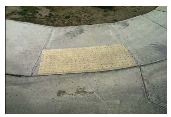
Installation 5A : located at northwest intersection of 1<sup>st</sup> Ave. N. W. and 6<sup>th</sup> St. N. W.

These installations are performing well to poor, 5 B & C has dome loss since last inspection, due to apparent blade damage. Adhesion is good. Color retention is fair.