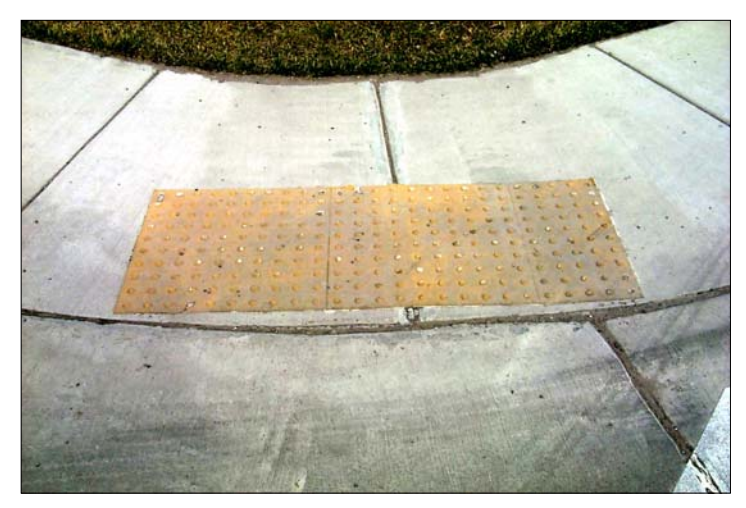
Installation 7 : Located on the northwest corner of the intersection of 3<sup>rd</sup> Ave. N. W. and 6<sup>th</sup> St. N. W.

This treatment is failing rapidly. The surface of the mat has continued to rip and tear. There is additional dome loss since the pre-winter evaluation. Edges are loosing adhesion. Color is fair. At this time it is not a trip hazard.