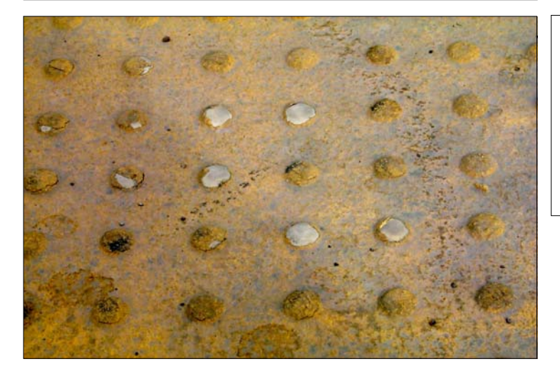
Installation 6B : Example of delaminating and cracking surface application of the rubber domes.

Although not seen as a slip hazard, this will facilitate future loss of domes.