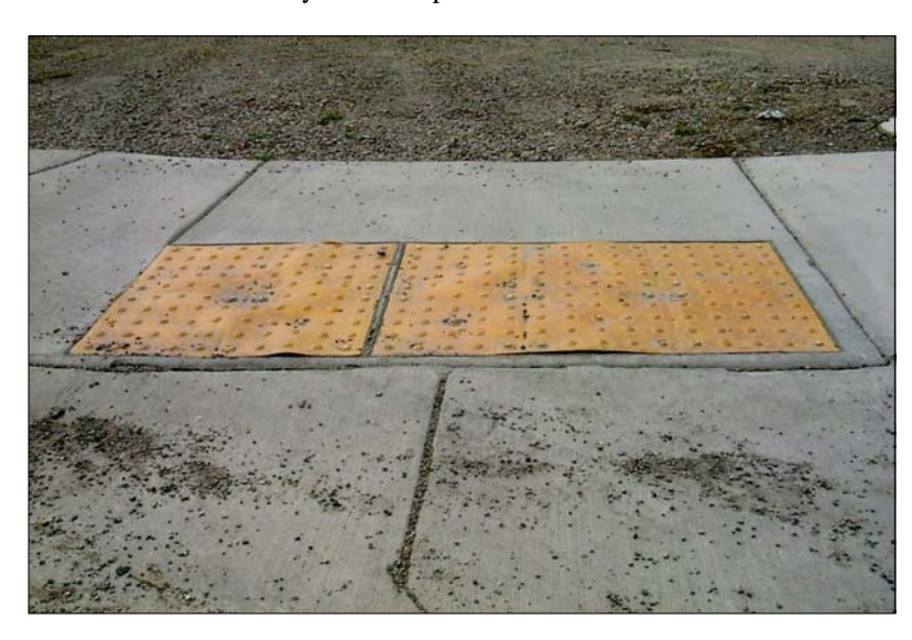
Installation 2 : Located on the southwest corner at the intersection of 6<sup>th</sup> Ave. N. W. and 6<sup>th</sup> St. N. W.

This treatment performed poorly since construction. Approximately 35% of dome relief has been loss through use of a shovel or blade apparatus during the 2004-05 winter. Domes are wearing rapidly. The edges within the treatment and perimeter are beginning to loose adhesion. The tactile response is spongy, substantial air pockets beneath the mat, severe loss of adhesion. The setting pins are breaking off. Color is good. This treatment has been determined as a trip hazard and has been asked to be removed. Note that this devise was improperly installed and most likely led to its premature failure.