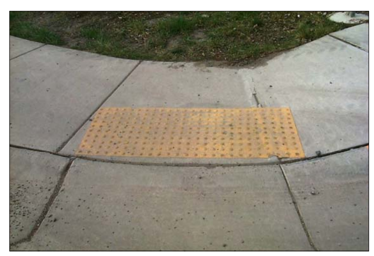
Installation 6A : located on the southwest corner of the intersection 2<sup>nd</sup> Ave. N. W. and 6<sup>th</sup> St. N. W.

All installations were in poor condition at the time of inspection. Treatment 6A is continuing to lose adhesion around the edges of the mat. The anti-skid coating over the top of the rubber domes with treatment 6A & 6B is continuing to flake off. It is unclear if this is a result of blade damage, sunlight deterioration or through the action of freeze-thaw.