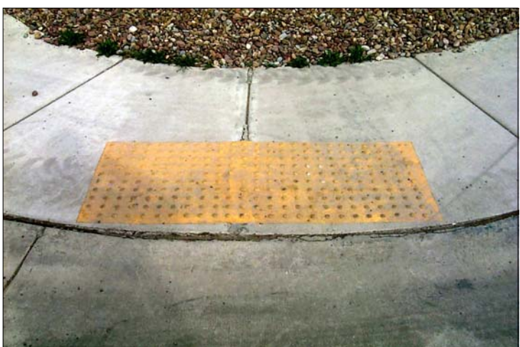
Installation 6B : located on the northwest corner of the intersection 4<sup>th</sup> Ave. N. W. and 6<sup>th</sup> St. N. W.