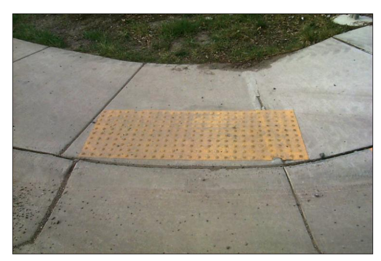
Installation 6A : located on the southwest corner of the intersection 2<sup>nd</sup> Ave. N. W. and 6<sup>th</sup> St. N. W.

All installations were in poor condition at the time of inspection. Treatment 6A is continuing to lose adhesion around the edges of the mat. The anti-skid coating over the top of the rubber domes with treatment 6A & 6B is continuing to flake off. It is unclear if this is a result of blade damage, sunlight deterioration or through the action of freeze-thaw.