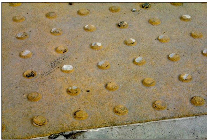
Installation 7 : Close-up of damaged mat. Loss of domes and torn surface.