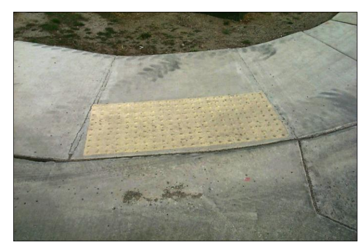
Installation 5A : located at northwest intersection of 1<sup>st</sup> Ave. N. W. and 6<sup>th</sup> St. N. W.

These installations have performed poorly, Substancial dome loss since last inspection, due to apparent blade damage. Adhesion is good. Color retention is fair.