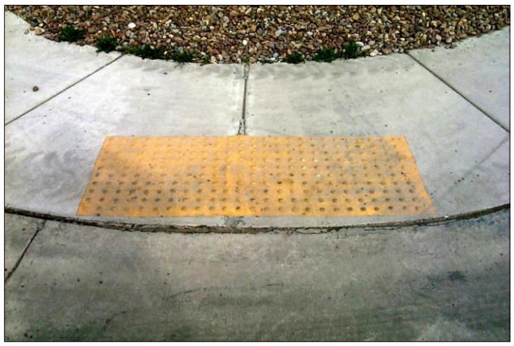
Installation 6B : located on the northwest corner of the intersection 4<sup>th</sup> Ave. N. W. and 6<sup>th</sup> St. N. W.