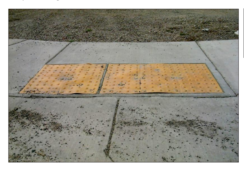
Installation 2 : Located on the southwest corner at the intersection of 6^{th} Ave. N. W. and 6^{th} St. N. W.

This treatment performed poorly since construction. Approximately 35% of dome relief has been loss through use of a shovel or blade apparatus during the 2004-05 winter. Domes are wearing rapidly. The edges within the treatment and perimeter are beginning to loose adhesion. The tactile response is spongy, substantial air pockets beneath the mat, severe loss of adhesion. The setting pins are breaking off. Color is good. This treatment has been determined as a trip hazard and has been removed. Note that this devise was improperly installed and most likely led to its premature failure.