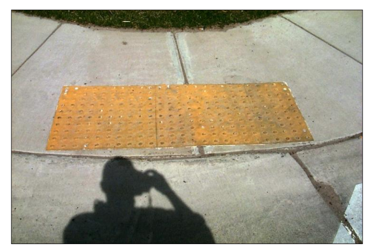
Installation 7 : Located on the northwest corner of the intersection of 3<sup>rd</sup> Ave. N. W. and 6<sup>th</sup> St. N. W.

This treatment is failing rapidly. The surface of the mat has continued to rip and tear. There is additional dome loss since the pre-winter evaluation. Edges are loosing adhesion. Color is fair. At this time it is not a trip hazard.