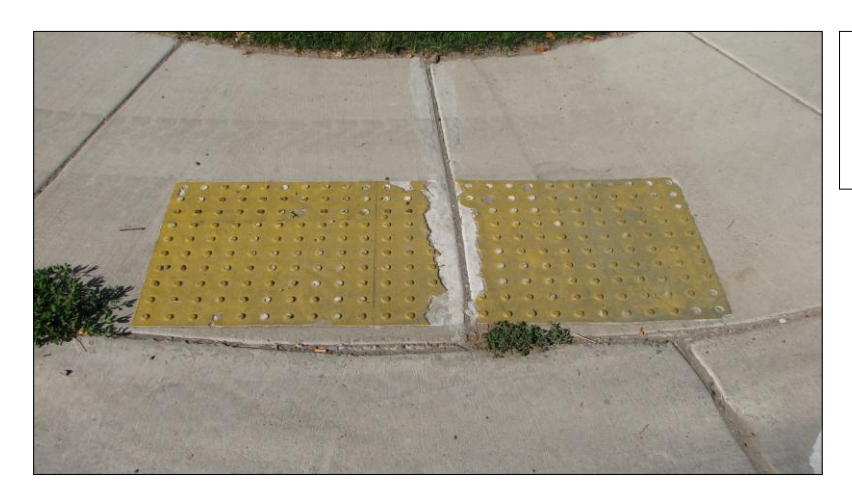
Installation 7 : Located on the northwest corner of the intersection of 3<sup>rd</sup> Ave. N.W. and 6<sup>th</sup> St. N.W.

This treatment is failing rapidly. The surface of the mat has continued to rip and tear. There is substantial dome loss since the 2006 evaluation. Edges are loosing adhesion. Color is fair. At this time it is not a trip hazard.