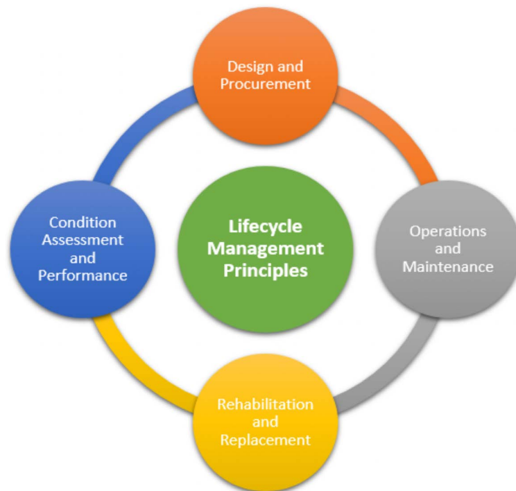
Figure 1-1 Lifecycle Management Principles

Transit agencies are responsible for the planning and implementation of lifecycle management for all asset categories. Within an agency, a manager or senior-level staff member is usually in charge of an asset category's maintenance and, ideally, is also involved in the asset's design and procurement. This staff member is responsible for lifecycle management planning, developing and implementing