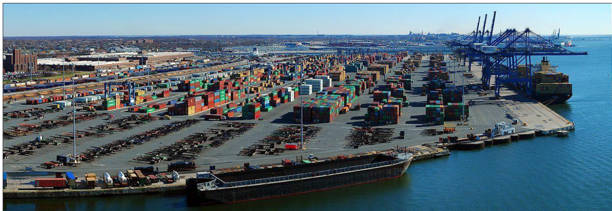
Figure 3: Seagirt Marine Terminal, Port of Baltimore