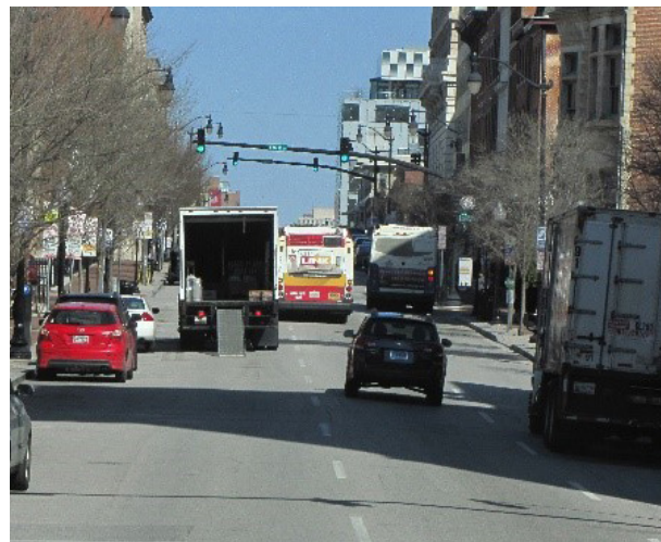
Figure 1: Example of urban freight delivery/parking in downtown Baltimore

The region is experiencing freight movement challenges in two key areas: the City of Baltimore's Central Business District (CBD) and the new Tradepoint Atlantic development at Sparrows Point in Baltimore County. The CBD is a busy tourist area with a limited grid system and many ongoing development projects producing increased congestion (see Figure 2). Tradepoint Atlantic is a 3,100-acre, multi-modal logistics facility in development on the site of a former Bethlehem Steel plant, located less than 10 miles from downtown Baltimore. With FedEx Ground as an anchor tenant, the site's warehouses and retail spaces are under construction; the site is expected to be fully operational within the next ten years. Tradepoint Atlantic is projected to generate 36,000 daily, two-way trips by 2025, 47 percent of which are anticipated to be truck trips. Both Tradepoint Atlantic and the CBD are integral components of the Baltimore region's freight system. As freight traffic continues to increase within the region (particularly in and around the CBD and Tradepoint Atlantic facility), stakeholders across the Baltimore region are working to proactively manage the impact on surrounding businesses and communities.