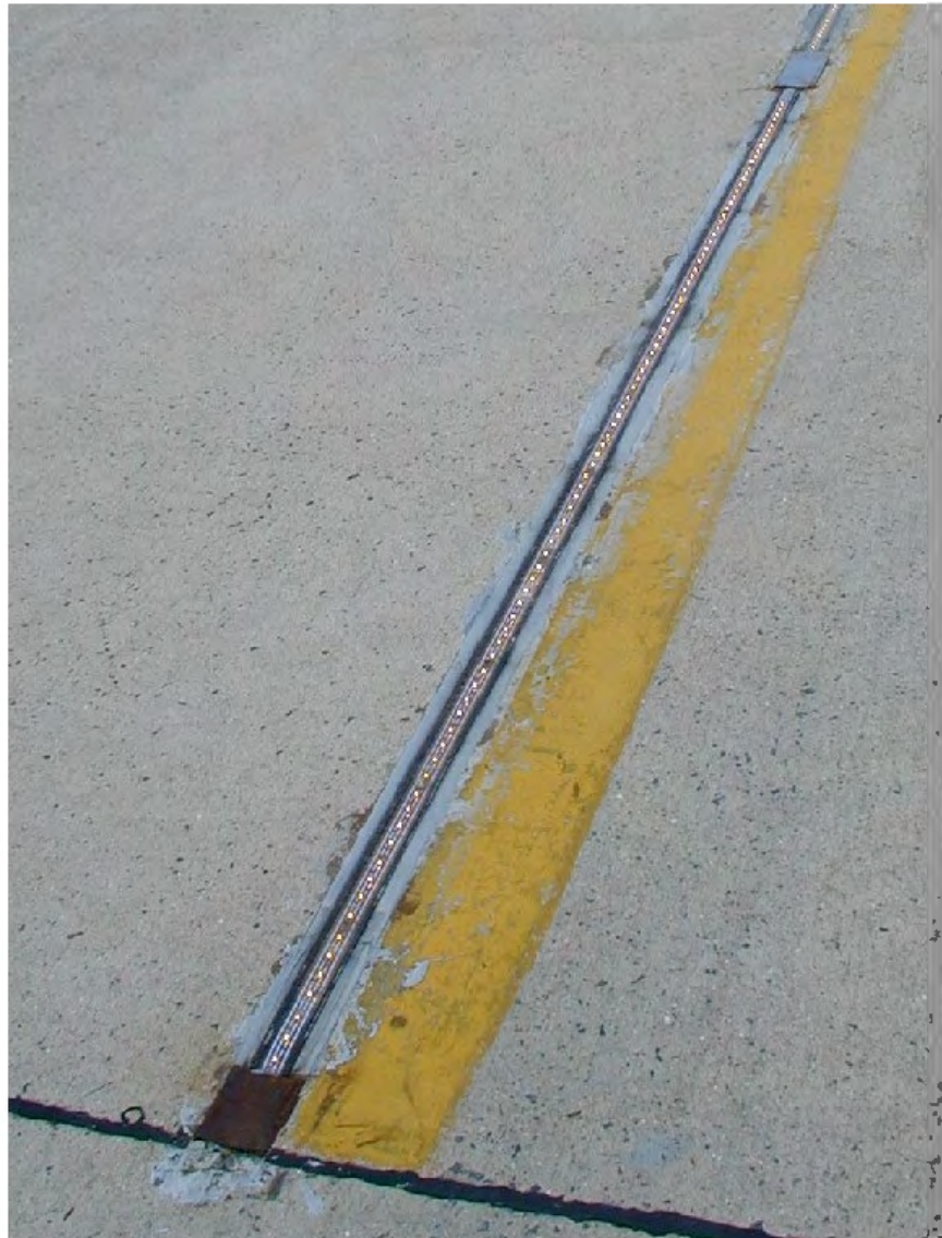
FIGURE 3. LED-STRIP SECTION PHOTOGRAPH

Some difficulty was experienced with maintaining a constant level with the surrounding pavement within each strip due to what seemed to be excessive flexibility of the “U” channel provided to support the encapsulated LED lights. Even using closely spaced mounting templates, per the manufacturer’s instructions, it was necessary to add 1/2” by 1/2” angles underneath the channel for rigidity during installation in the saw-cut trench.