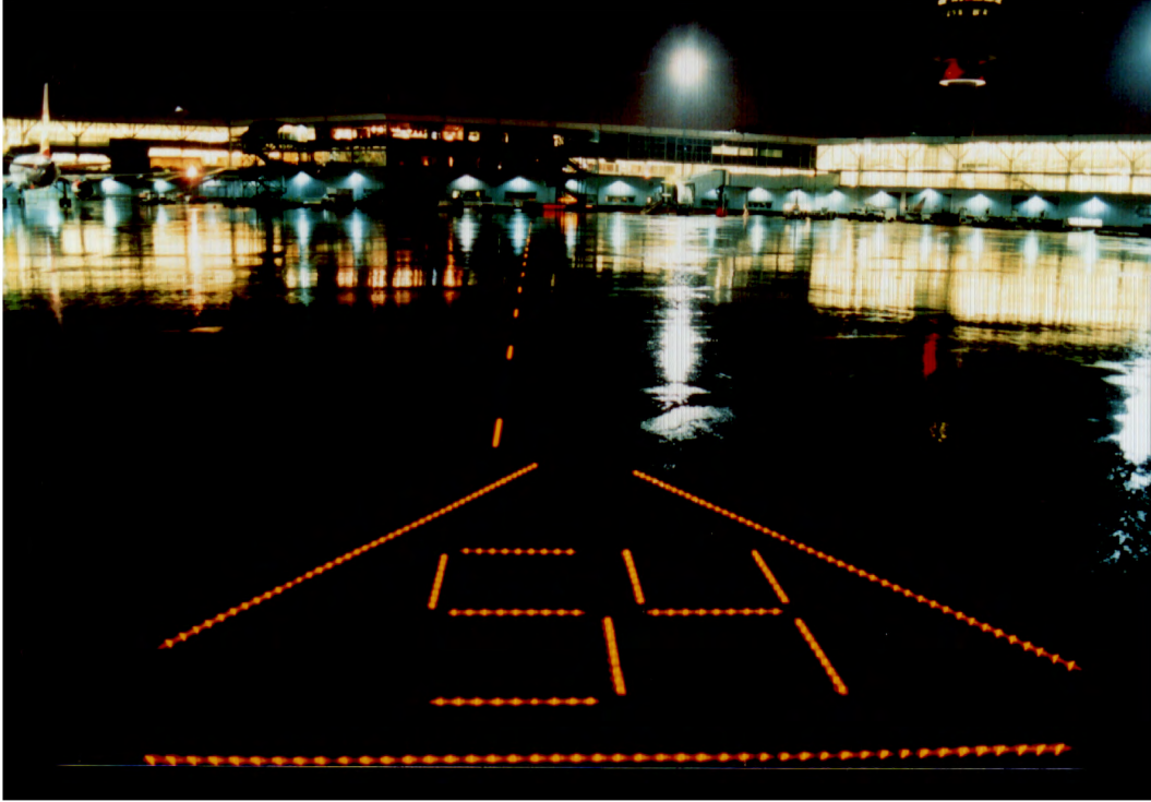
FIGURE 1. VANCOUVER, BRITISH COLUMBIA AIRPORT DEMONSTRATION INSTALLATION