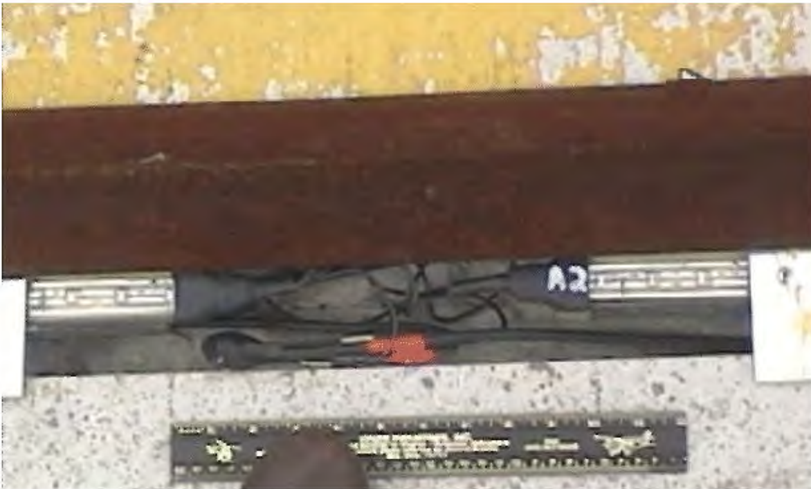
FIGURE 8. CONNECTION SPACE BETWEEN LED SECTIONS

During a period of approximately 6 months, the LED-strip parking position indicator was operated intermittently whenever visiting aircraft arrived. Almost all malfunctions or failures occurred because of the connector design mentioned earlier in this report. A gap between LED sections, of about 10 inches in length, was necessary to provide room for the connectors and for the connections with the feeder cables running beneath the LED strips (see figure 8). This void was filled with a solidified foam and protected with a U-shaped steel cover to protect the wiring and reduce water contamination. Unfortunately, the tops of the original sealed connectors protruded above the surface level of the LED strips. Under pressure from aircraft and vehicles passing over the covers, the connectors soon were bent downward, causing frequent separation of the spring-loaded butt connection. In some cases, a vehicle passing over a cover would cause a section to go out, while another vehicle subsequently passing over would cause the strip to be re-energized. The fact that each section was fed from both ends, also caused disconnections to go unnoticed until both connectors had failed.