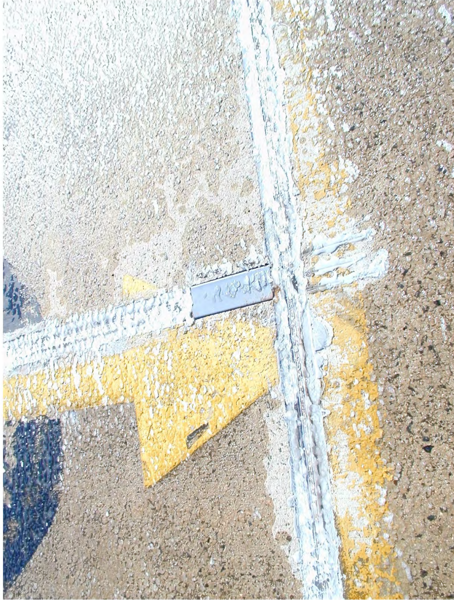
FIGURE 7. POSTSNOW APPEARANCE

The issue of characterizing the performance of LED light strips is a challenging task. Current advisory circulars, when dealing with lighting, specify performance in the form of photometric criteria such as beam spread and intensity. These measurements are based on sources with points or beams of light. The LED light strip, however, is a nonpoint source technology. Conventional point source photometric methods cannot accurately measure this linear or area source. No performance criteria exist at this time.