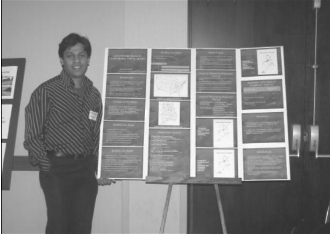
FIGURE A-2 Student presenter.