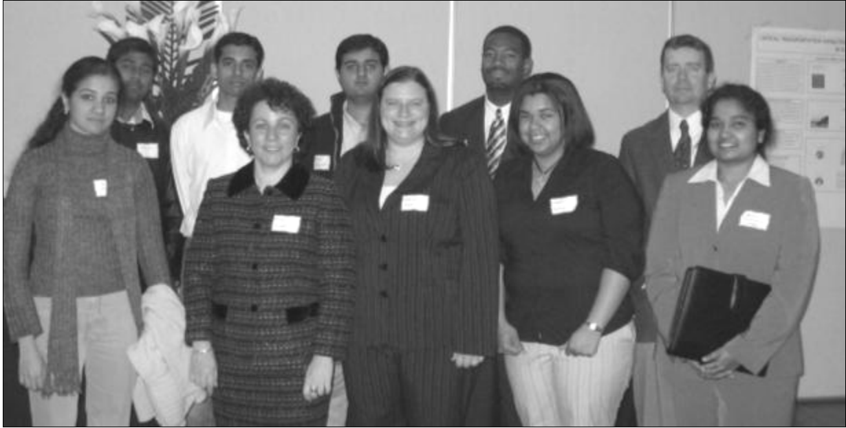
FIGURE A-1 UAB faculty with students.