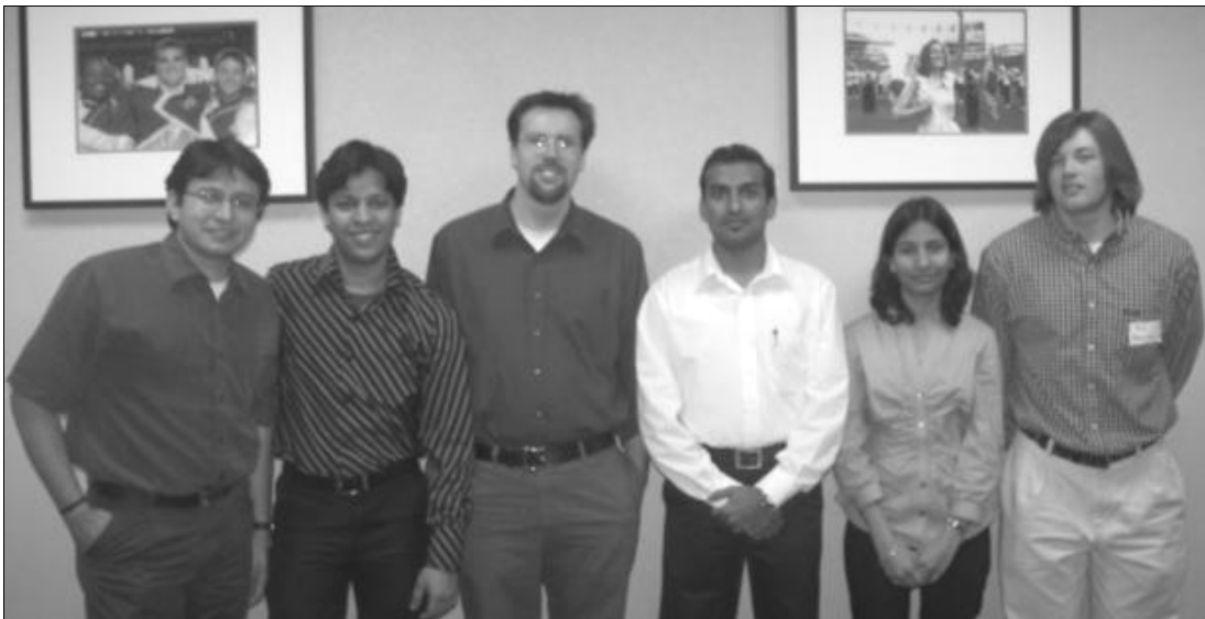
FIGURE A-3 Faculty and students.