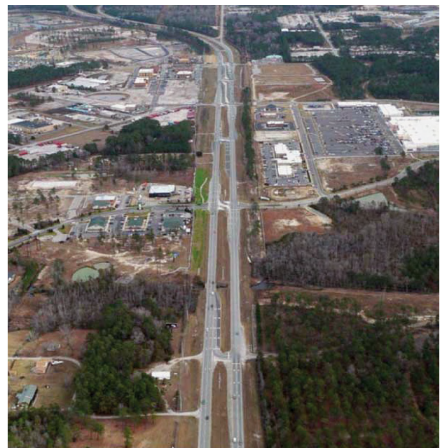
Figure 3. Photograph. US 17 Restricted Crossing U Turn Corridor

North Carolina Department of Transportation (DOT) has constructed RCUT corridors in lieu of freeways, significantly accelerating project implementation at reduced cost. In 2006, North Carolina DOT converted three conventional signalized intersections to RCUTs on a 0.6-mile segment (Figure 3) of US 17 near Wilmington for $2 million. The RCUTs are the first at-grade intersections after a freeway section of US 17 connecting to downtown Wilmington and help prevent a bottleneck at the end of the freeway. The cost of grade separating these intersections would have been an order of magnitude higher.