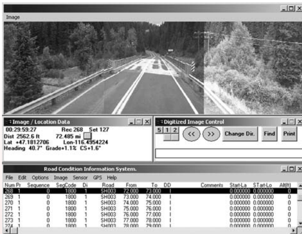
Fig. 3: Video log software

Image and data files from these surveys are downloaded to file servers located in each ITD District Office. The GRail program accesses this data over the department's Wide Area Network.