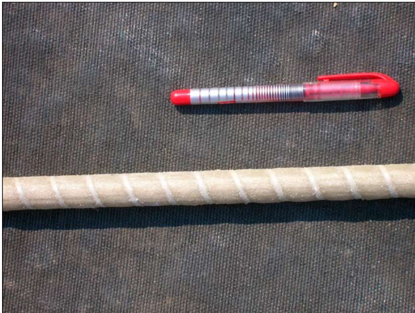
Figure 1. Closeup of a glass fiber–reinforced bar.

Advantages of FRP bars include not only their corrosion resistance, but also their high longitudinal strength, high fatigue endurance, and light weight. In addition, the electromagnetic transparency of FRP bars makes them suitable for use at toll collection booths where electromagnetic vehicle detectors are used (Walton and Bradberry 2005). Disadvantages of FRP bars include their high cost, low modulus of elasticity, and low shear strength.