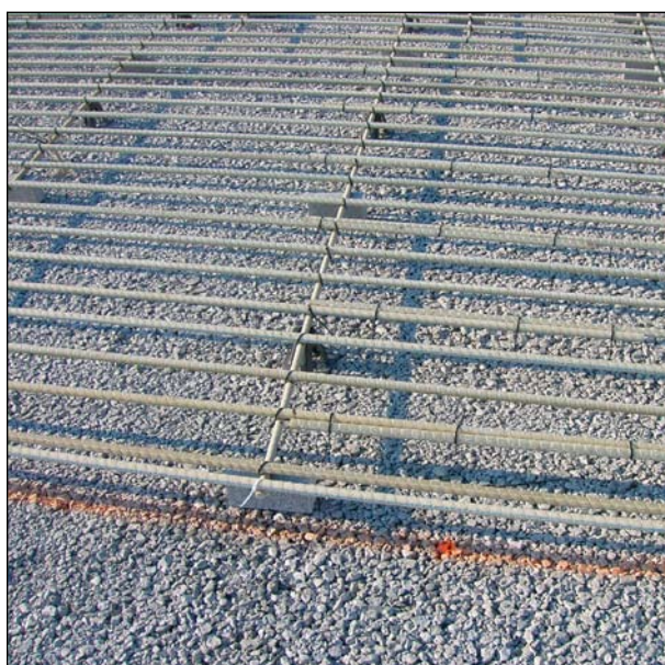
Figure 3. Glass fiber-reinforced polymer bars on grade prior to paving.

section. The researchers monitored the pavements continuously during the first 72 hours to investigate early-age cracking behavior and then obtained experimental results at 7, 28, and 38 days and at 4 months (Chen et al. 2008). Crack width data collected at 4 months showed 0.023 in. (0.58 mm) for the steel-reinforced CRCP and 0.034 in. (0.86 mm) for the GFRP-reinforced CRCP. Crack spacing data collected at about 6 months showed an average spacing of 7.1 ft (2.1 m) for the steel-reinforced CRCP and an average spacing of 12.6 ft (3.8 m) for the GFRP-reinforced CRCP. The greater crack spacing on the GFRP-reinforced CRCP is believed due to the relatively low reinforcement ratio and the use of the cement-stabilized open-graded permeable base, which likely increased the effective slab thickness and thereby further reduced the effective reinforcement content.