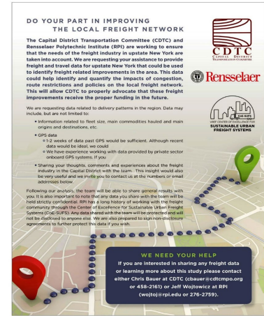
Figure 1. Image. Example of an outreach flyer distributed as part of the project.

The project team brought a long history of partnerships with the local freight community and used this experience to coordinate with stakeholders for data collection. First, the project team approached members of the CDTC Freight Advisory Committee. The project team also developed outreach materials describing the project ( Figure 1 ) and distributed these materials to the New York State Motor Truck Association and the Owner Operators Independent Driver Association. Finally, the project team coordinated with several rail companies in the region to obtain travel time information to identify potential bottlenecks on the rail system.