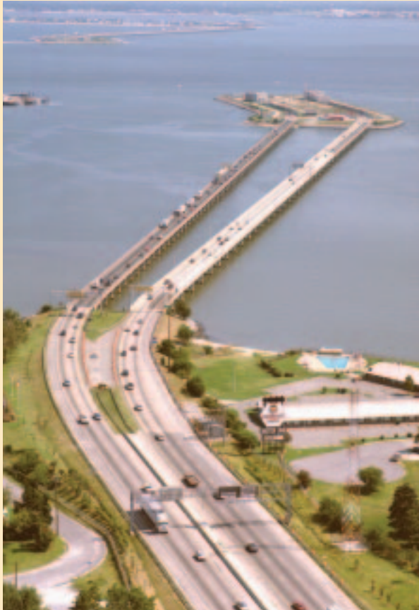
Hampton Roads Harbor Bridge- Tunnel on I-64

The Transportation Asset Management Case Study Series is the result of a partnership between State departments of transportation and the Federal Highway Administration (FHWA) Office of Asset Management. FHWA provides the forum in which to share information, and the individual States provide the details of their experiences. For each case study report, FHWA interviewed State transportation staff, and the resulting material was approved by the State. As such, the reports rely on the agencies' own assessment of their experience. Readers should note that the reported results may or may not be reproducible in other organizations. ■