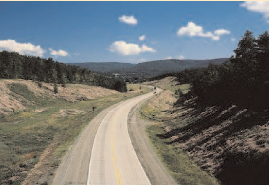
SR 15, Tioga County

The Transportation Asset Management Case Study Series is the result of a partnership between State departments of transportation and the Federal Highway Administration (FHWA) Office of Asset Management. FHWA provides the forum in which to share information, and the individual States provide the details of their experiences. For each case study report, FHWA interviewed State transportation staff, and the resulting material was approved by the State. As such, the reports rely on the agencies' own assessment of their experience. Readers should note that the reported results may or may not be reproducible in other organizations. ■