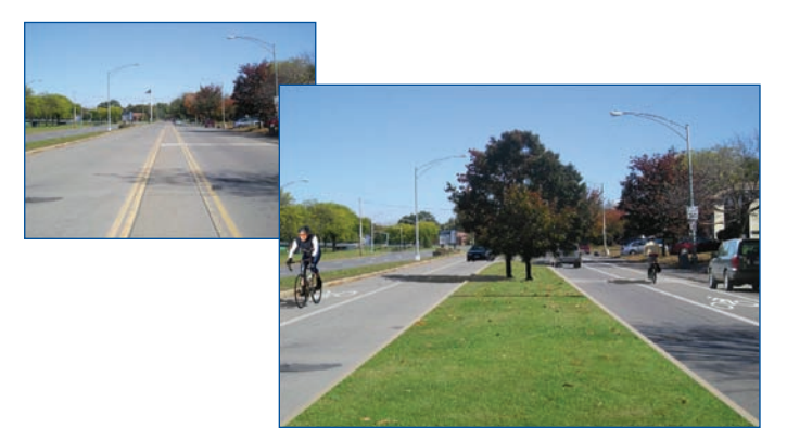
Figure 2: Visualization Example – Brevator Street (Harriman Campus, University of Albany Transportation Study), Existing and Concept

Linkage Studies. CDTC's linkage studies have become the primary focus of corridor and local-area planning. The Community and Transportation Linkage Planning Program is the cornerstone of CDTC's local planning assistance and public outreach efforts, and focuses on transportation, land use, and good site and community design as essential elements in achieving regional transportation system goals. More than 60 studies have been conducted to date. CDTC asks municipalities to put up a 25 percent match and agree to the New Vision's principles, and it hires a consultant to help address local transportation and land use planning issues. These studies often involve indepth analysis of a given corridor, addressing issues such as traffic, safety, pedestrian and bicycle access, urban revitalization and redevelopment, and transit-supportive built environments. Visualization techniques are often used to help the public understand alternative options for a corridor or roadway (see figure 2).