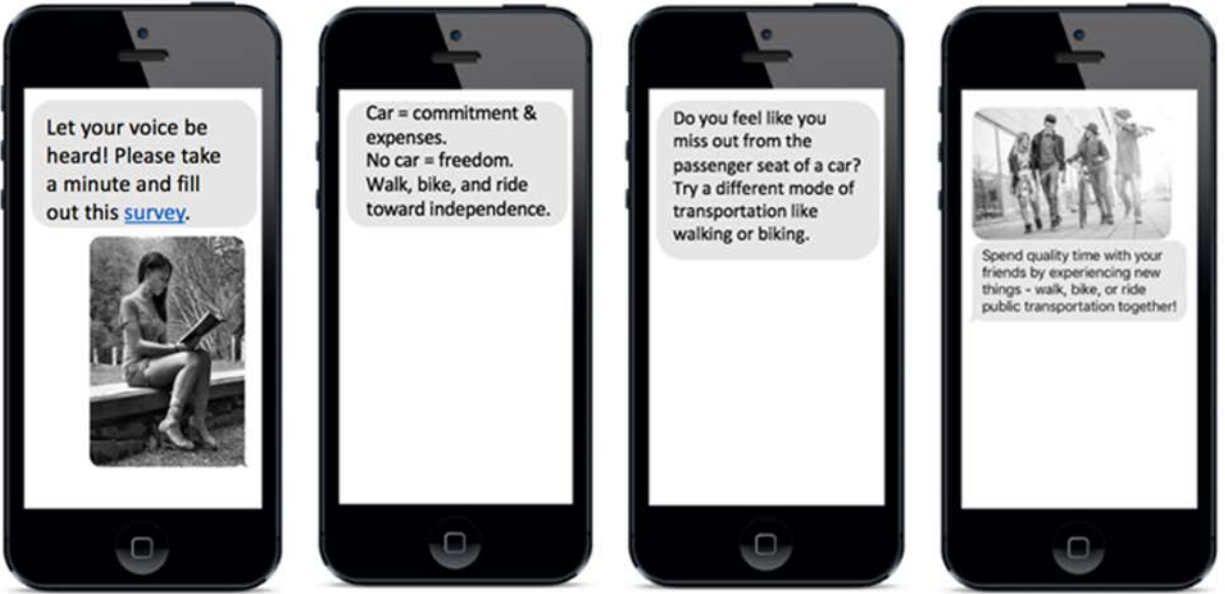
Figure 3.2: Most negatively reviewed messages