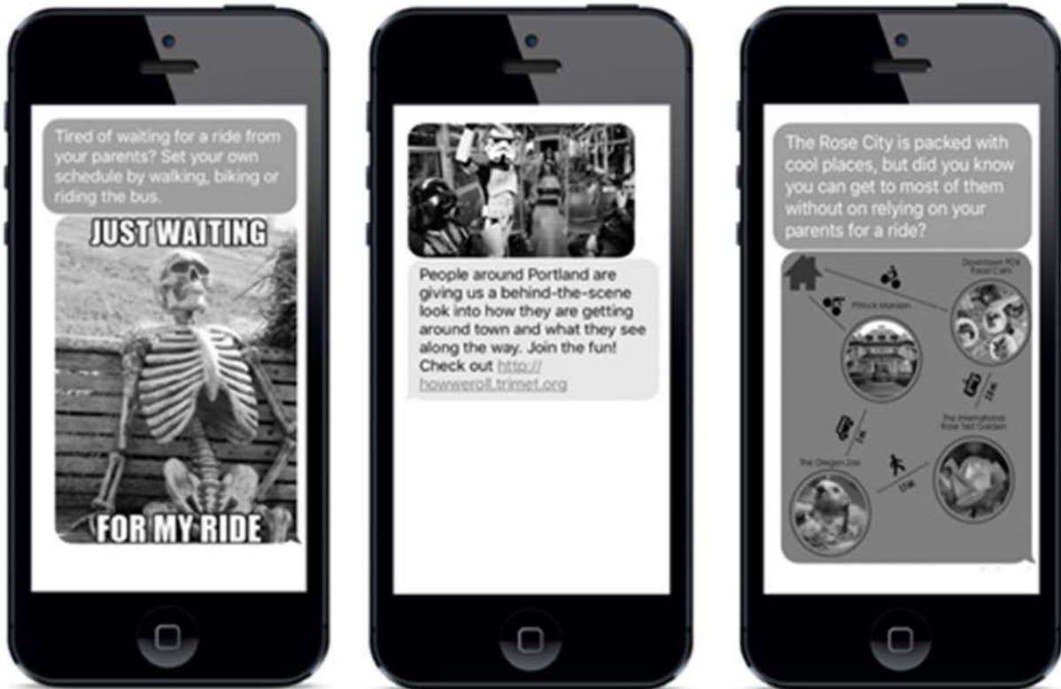
Figure 3.1: Most positively reviewed messages