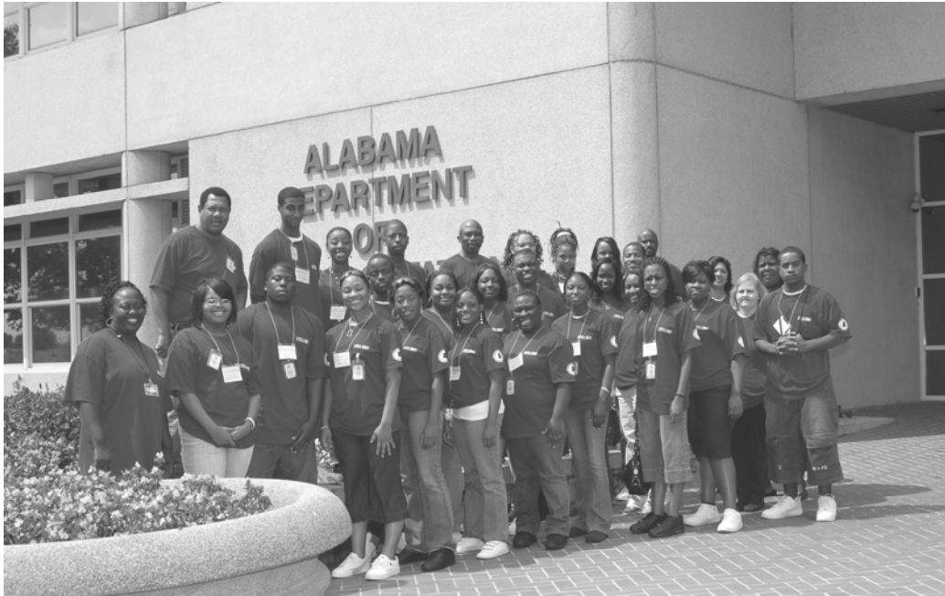
Figure C-1. ATI-07 students at ALDOT headquarters