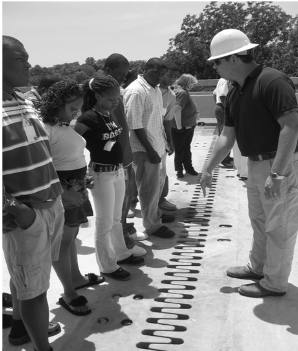
Figure C-2. ATI-07 students on the bridge field trip