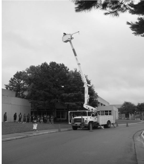
Figure C-3. Egg drop competition, with the bucket truck at 45 feet high