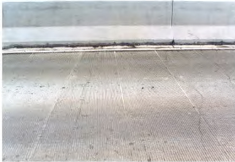
Photo 18. Transverse cracks above Pier #2 (District 6 – Stage 1 “creek” bridge, March 13, 2000)

The more severe and visible transverse cracks were located directly above the piers. Two cracks in an hourglass shape were located above Pier #1 in Stage 1 of the “creek” bridge (see Photo 18) Two fairly straight transverse cracks were located above Pier #2. The survey notes for the 1999 PPC deck plank bridges previously surveyed indicate that similar cracks were located over most of the piers.