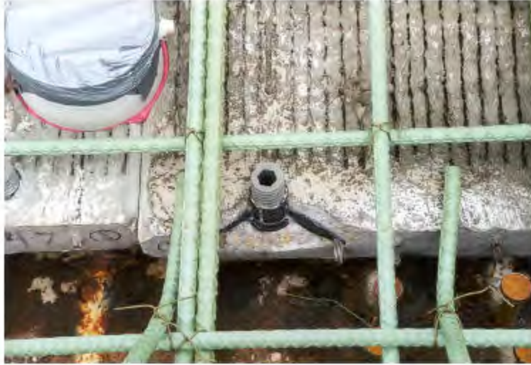
Photo 8. Spall at leveling insert (District 8 – Stage 1, June 24, 1999)