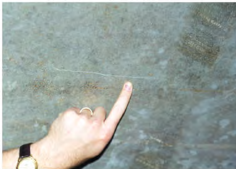
Photo 19. Crack on underside of PPC deck plank (District 6 – “overflow” bridge, May 30, 2000)

The surveyors examined the underside of both bridges. While they were able to look at all three spans of the “overflow” bridge, they were only able to look at one span of the “creek” bridge due to the water level. They found only one plank in the “overflow” bridge that appeared to have some cracking (see Photo 19). Even the cracking they saw was minor. The rest of the planks appeared to be in good condition.