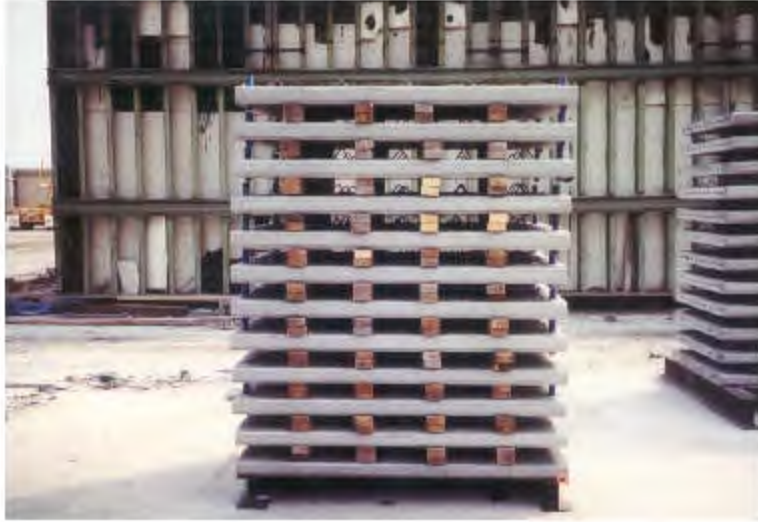
Photo 5. Load Test