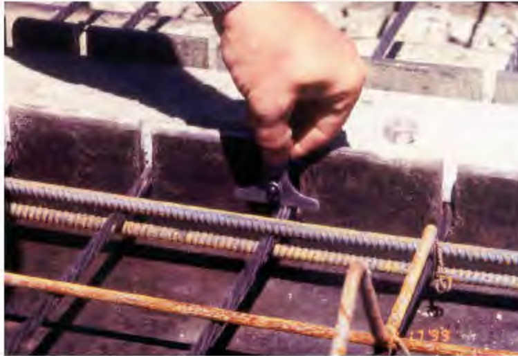
Photo 3. Checking vertical location of strand with micrometer