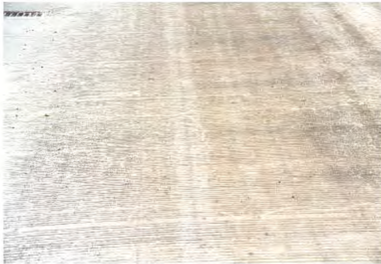
Photo 16. Longitudinal Crack (District 8 – Stage 1, January 28, 2000)

Stage 1 (see Photo 16). Like the December survey, no longitudinal cracks and only two transverse cracks were found in Stage 2.