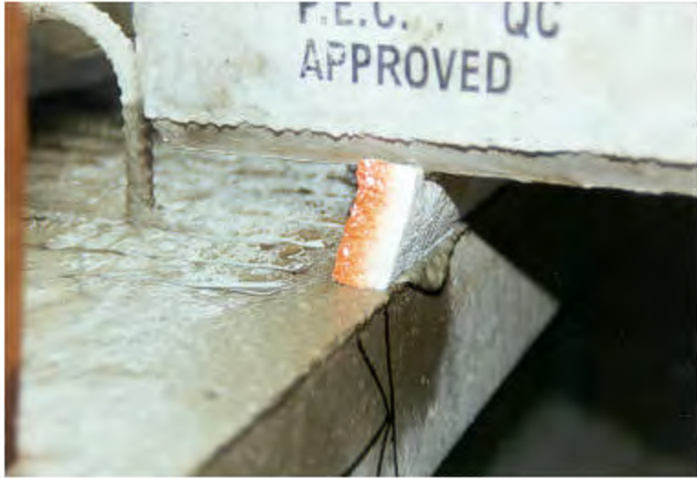
Photo 1. PPC deck plank seated on polystyrene (July 1999 – District 6)