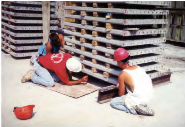
Photo 6. Checking deflection with stringline

Deflection was measured a total of four times. First, deflection was measured immediately after the load was applied. Then, it was measured approximately 24 hours after the first measurement, just prior to the removal of the load. It was then measured immediately after the load was removed. Finally, deflection was measured 24 hours after the load was removed.