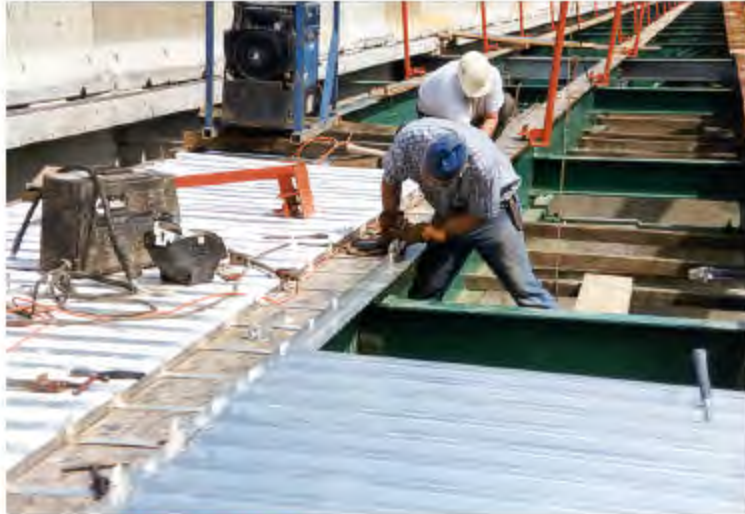
Photo 20. Seating metal stay-in-place forms (District 8 – May 1999)

Metal stay-in-place forms were incorporated into two spans of the Jersey-Greene county bridge in District 8. The permanent metal deck forms were placed between the exterior girders in spans 4 & 5 (see page 7 and Photos 20 and 21).