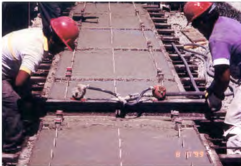
Photo 2. Vibratory Screed

The PPC deck planks for both projects were fabricated at the Prestress Engineering Corporation (PEC) Blackstone production plant. Planks were manufactured according to the applicable requirements of Section 504 of the Illinois Department of Transportation Standard Specifications for Road and Bridge Construction (January 1997) , and the contracts' special provisions. Casting beds were set up for a lot size of 8 planks, each 4 feet wide and 5 to 6 feet long. Eleven prestressed strands were placed in headers with slots designed for individual strands. The planks were also reinforced with wire mesh. Leveling jack inserts were imbedded into the planks to allow for fillet height adjustment during deck plank seating. The surface of the plank lot was leveled off with a vibratory screed, as shown in Photo 2. Laborers then hand-finished and tined the surface.