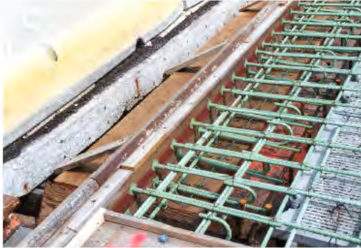
Photo 10. Bottom splice bars cut short (District 8 – Stage 1, June 24, 1999)

Because of the deck planks, reinforcement bars had to be modified in some places. Splice bars had to be cut three to four inches shorter, because they were too long to accommodate the deck planks (see Photo 10). Some of the vertical bars for the parapet wall had to be cut shorter, since they had to rest on the deck planks (see Photo 11).