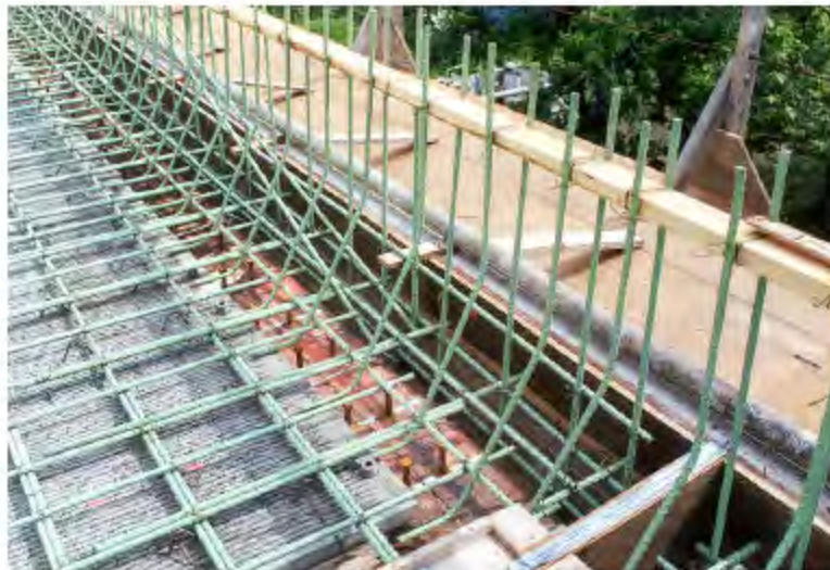
Photo 11. Inside parapet wall bars resting on plank (District 8 – Stage 1, June 24, 1999)