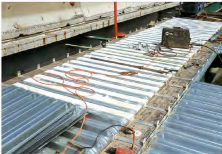
Photo 21. Polystyrene fillers in metal stay-in-place forms (District 8 – May 1999)

Distress surveys of the spans with metal stay-in-place forms were conducted in conjunction with the distress surveys of the spans with PPC deck planks. The following tables summarize the distress surveys on December 1, 1999; April 7, 2000; and May 16, 2000.