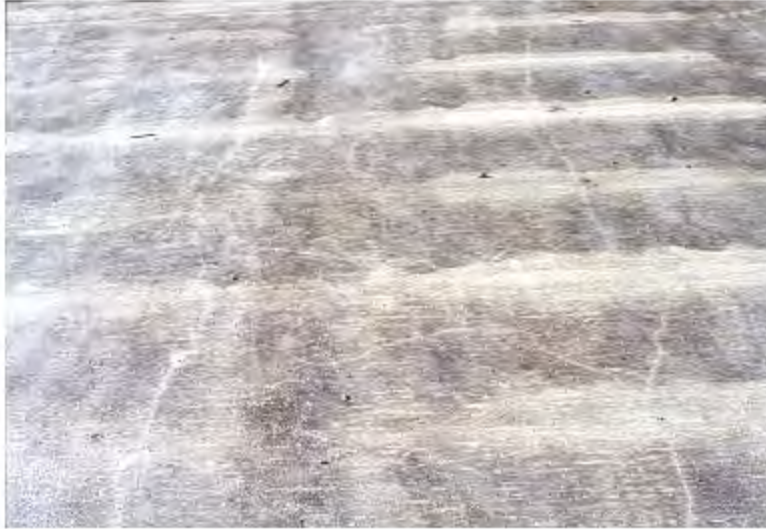
Photo 17. Longitudinal, transverse, & diagonal cracks before traffic loading (District 6 – Stage 1 “overflow” bridge, August 30, 1999)