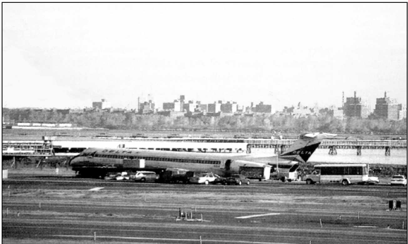
FIGURE 2. This photo shows the wreckage of Delta 554 as it sat aside Runway 13 at LaGuardia Airport. Three passengers suffered minor injuries during the emergency evacuation that was ordered by the pilot after a report of the smell of jet fuel.

According to the NTSB report, several factors may have contributed to the Delta 554 accident. The lights on Runway 13 were spaced 150 feet apart, while the lights on most runways are 200 feet apart. To pilots accustomed to 200-foot spacing, this difference could result in an overestimation of their altitude by 70 feet. Runway 13 had an infrequently used ILS approach that was made more difficult by the ILS localizer being offset to the right of the runway centerline by several degrees of arc. The ILS approach required the pilot to turn left slightly after transitioning to visual references. In an approach over water under reduced lighting conditions, there