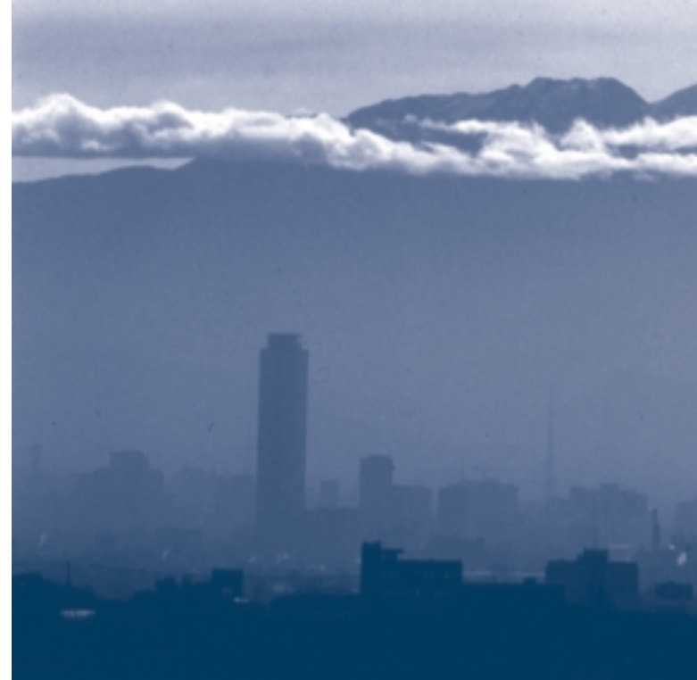
Mexico City's high altitude results in worsening air quality.

In addition to the threats to the environment and to human health, urban transportation trends also raise equity questions. In cities where large segments of low-income groups live in the periphery of the urban area, questions of isolation and inaccessibility arise because opportunities for employment, advanced education, recreation, and shopping are often located in the city center. Members of poor households, for example, may spend a larger percentage