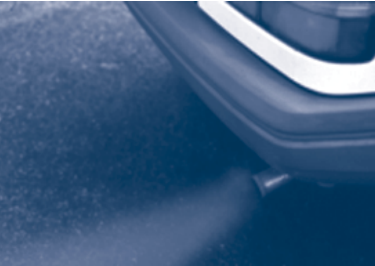
Vehicles emit greenhouse gases that contribute to smog.

fifth of all households worldwide, and research has shown that they focus their spending on nutrition and education, not on private transportation. These households may therefore use more public transportation facilities, if available. 8