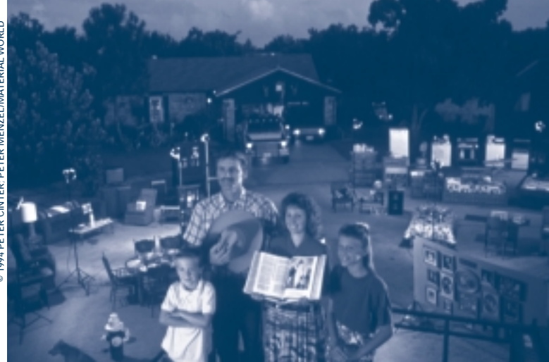
In 1994, almost 60 percent of U.S. households owned two or more cars.