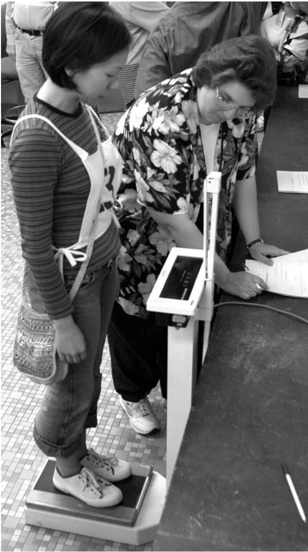
Figure 6. Female subject's weight is documented.