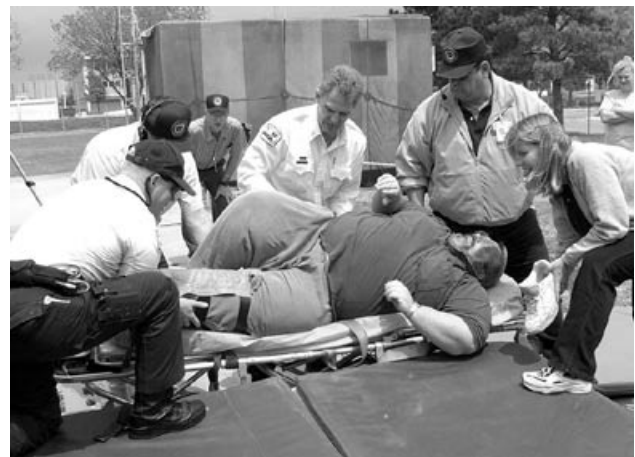
Figure 17. Paramedics secure injured subject on stretcher in preparation for evacuation to hospital.