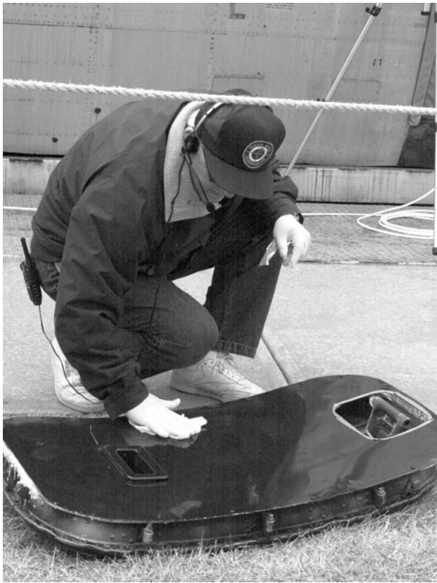
Figure 21. Safety officer decontaminates bloody hatch.

understanding injuries associated with evacuation research and the variables that can cause or reduce injuries. Development of this type of classification system and associated database can also improve compliance with reporting requirements necessary for conducting research using human subjects. Furthermore, the careful definition of injury patterns associated with evacuation studies can be extremely useful in the medical response planning phases of research protocols. Knowing the type of injuries to expect may provide cost-effective procedures for enhancing subject safety by ensuring appropriate preventive and response measures.