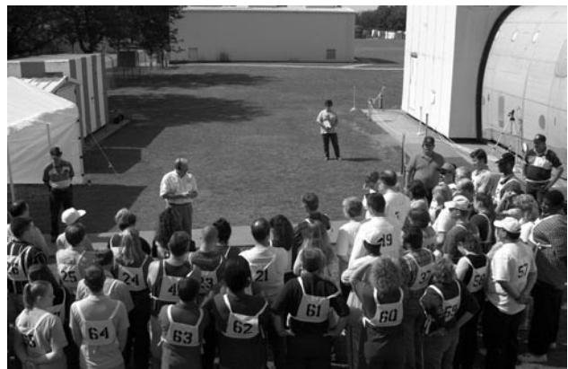
Figure 10. Subjects are familiarized with the simulator and research team.