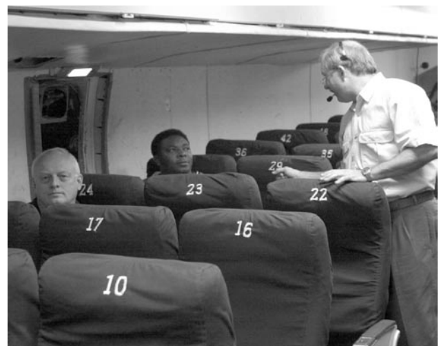
Figure 12. Hatch operator is individually seated in simulator (safety monitor in row ahead).

Experimental Procedure. A start buzzer was used to signal the beginning of each evacuation. At the sounding of the buzzer, the hatch operator removed the hatch and disposed of it (Figure 13). The flight attendants loudly and enthusiastically commanded the subjects to unbuckle their seatbelts and proceed through the Type-III exit, continuing their shouts and gestures throughout the evacuation (Figure 14). After each trial was completed,