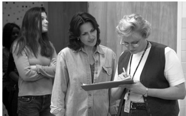
Figure 2. Each subject's name was checked against the registration roster for clearance.