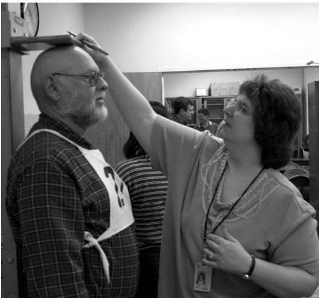
Figure 7. Male subject's height is documented.