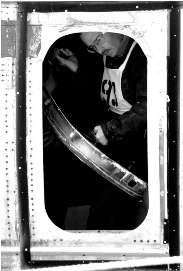
Figure 13. Hatch operator removes and disposes of hatch at the start of the evacuation.