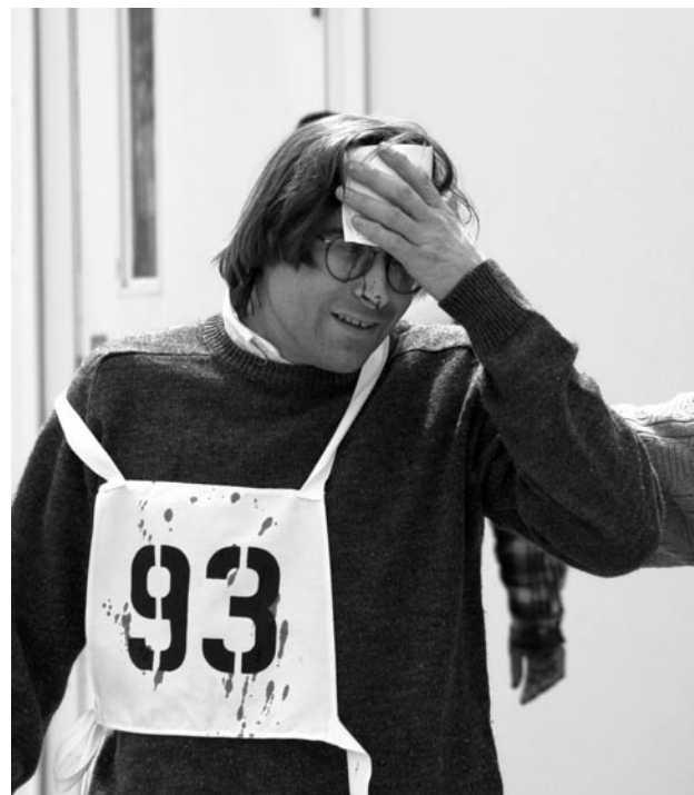
Figure 20. Hatch operator lacerated his head with the top edge of the hatch.

Three hatch operators, two of whom required stitches, hit themselves on the head with the hatch when they pulled it from the exit opening. They reported that they had expected the hatch to be heavier than it was, thereby inducing them to be more forceful than was necessary to remove it, striking themselves on the forehead with the top edge of the hatch (Figure 20).