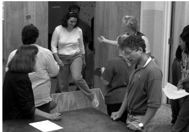
Figure 1. A step-over task assessed gross motor agility as subjects entered lab on test day.

Subject In-processing. As subjects entered the laboratory on test day, their gross motor agility was assessed by a step-over task (Figure 1), utilizing a 16" high barrier similar to the exit sill of a Type-III exit. Subjects' names were then checked against the registration roster (Figure 2), and those who had already been approved were issued a numbered vest (Figure 3). Subjects who required additional medical screening, had difficulty clearing the