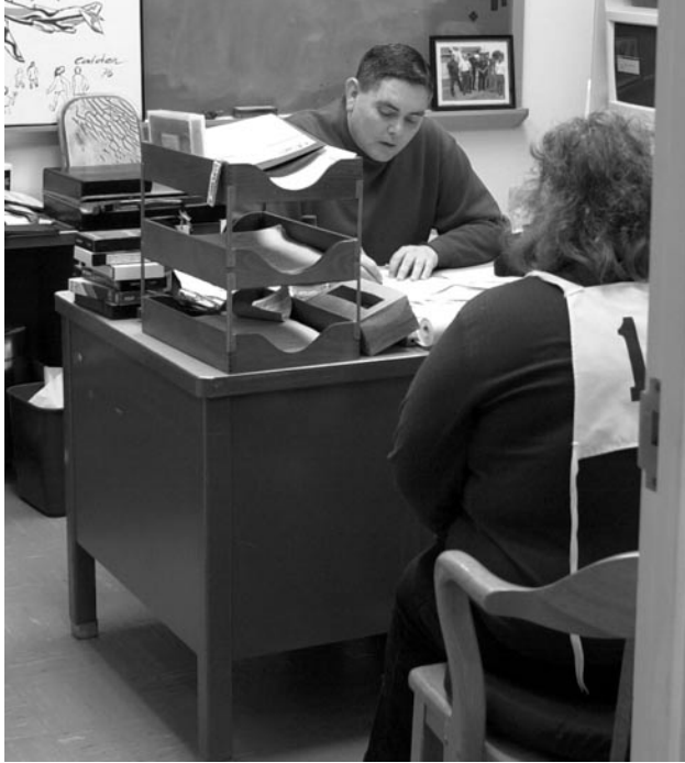
Figure 4. Subject is interviewed by physician concerning potentially disqualifying health condition.

barrier, appeared to be under the influence of alcohol or drugs, or exhibited a potentially disqualifying condition not reflected on the health questionnaire, were directed to a medical interview room (Figure 4). Subjects who arrived without a health questionnaire on file had to complete the health questionnaire, as well as the medical screening, if necessary, before they could participate.