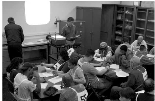
Figure 5. A research team member reads the consent form as subjects follow along.

The Individual's Consent to Voluntarily Participate in a Research Project – Form N (for low-motivation groups; Appendix D) or Form I (for high-motivation groups; Appendix E) was read aloud as the subjects followed along (Figure 5). The form explained the purpose, procedures, and duration of the research, benefits and risks to the subjects and to society, confidentiality of the information collected, voluntary nature of participation, medical care in the event of injury, and whom to contact for answers to pertinent questions about the research. (See 49 CFR 11.116 and 45 CFR 46.116 for the general requirements for informed consent.) Subjects were again given ample opportunity to ask questions before signing the consent form.