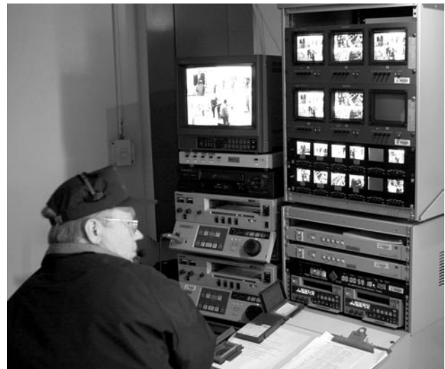
Figure 15. Control station for audiovisual recording of the evacuation trials.