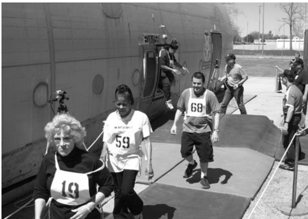
Figure 14. Subjects evacuate through the Type-III exit onto padded "winglet."