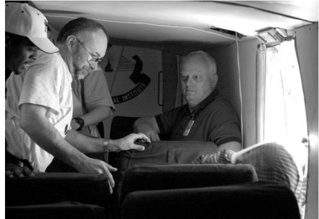
Figure 16. Safety monitor positioned to oversee the evacuation and sound the stop bell if necessary.