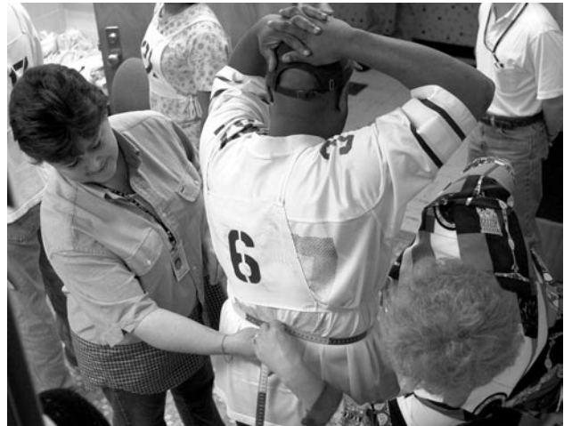
Figure 8. Research team members measure and record male subject's waist size.