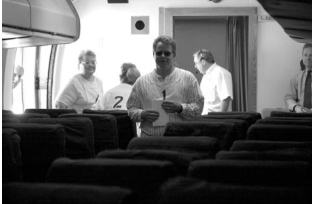
Figure 11. Subjects board the simulator and seat themselves according to the boarding card.

A Familiarization Briefing (Figure 10) was conducted outside the airplane simulator to allow subjects to become acquainted with the equipment layout around the simulator, the evacuation route, and the research team members who could be addressed if a subject had a problem or needed assistance. Another opportunity for subjects to ask questions was provided. Each subject was then issued a boarding card with a specific seat assignment before entering the simulator and being seated (Figure 11).