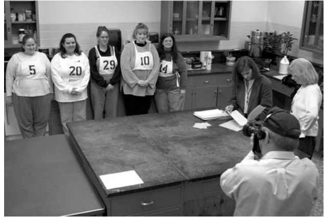
Figure 9. Photographs were taken of all subjects to link vest numbers with appearance.