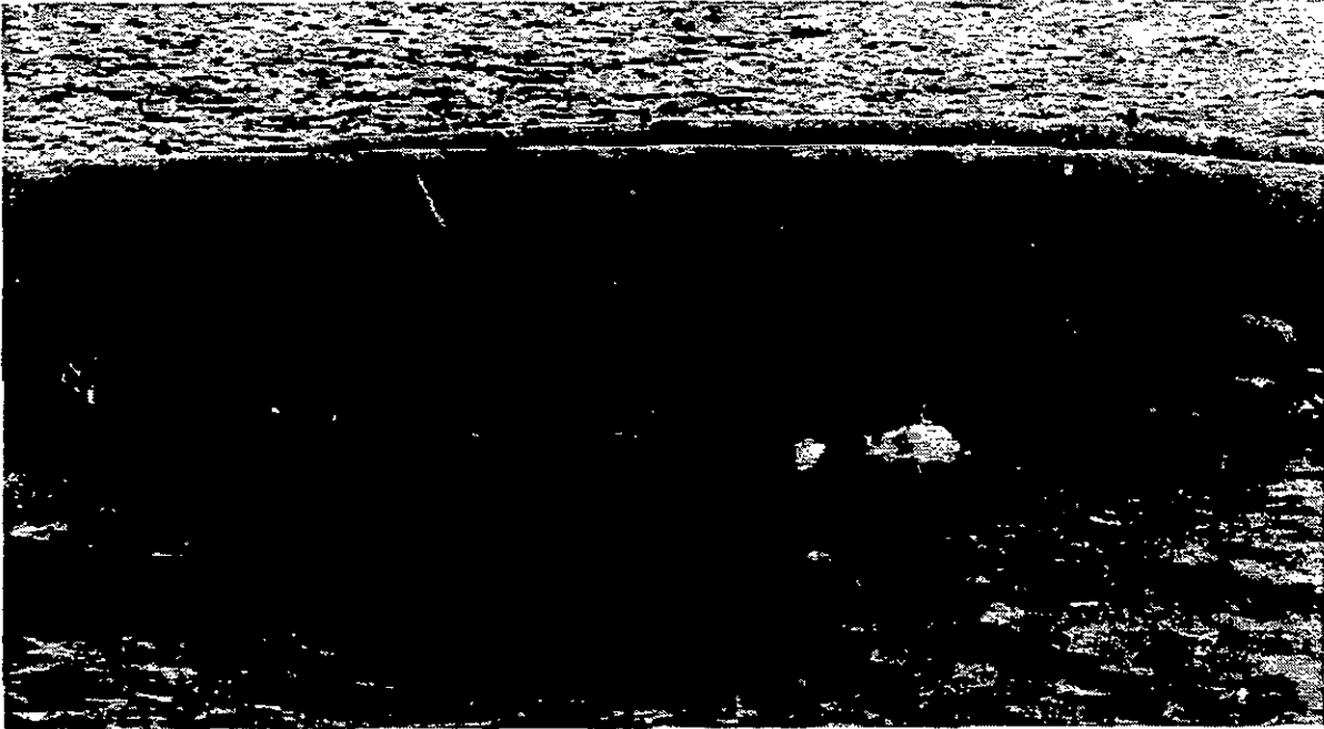
FIGURE 4 OPEN WATER EXERCISE