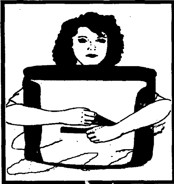
FIGURE 1 Vertical Flotation