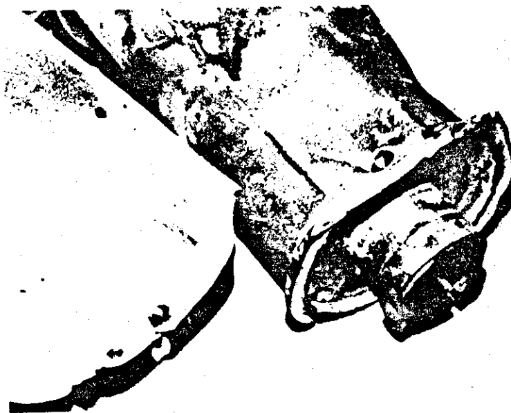
Figure 1. Muffler from a single engine aircraft. Note the split in the muffler and the discoloration caused by exhaust gases as they contacted the wall of the cabin heat exchanger shroud. The pilot was incapacitated in flight by carbon monoxide and killed in the crash that followed.

Case 2. The pilot, the only occupant of a Piper TriPacer, departed a local airport at 1700 on a cold December afternoon for the purpose of practicing touch-and-go procedures. The flight before the fatal accident was of 30-minutes' duration. The crash occurred in a wooded area adjacent to a large open field. The plane descended into the trees at a shallow angle paralleling the border of the open field. No autopsy was performed on the pilot but blood was submitted for toxicological analysis. A carboxyhemoglobin level of 23 percent was found. The pilot had been thrown free of the burned aircraft and gross injuries suggested that he died immediately after the crash. The finding of an elevated CO saturation prompted close inspection of the exhaust and heater system. Investigators found a cracked exhaust muffler and staining of the heat exchange shroud by the exhaust gases (Figure 1). The