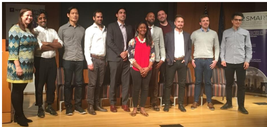
Figure 3: Mobility startup participants