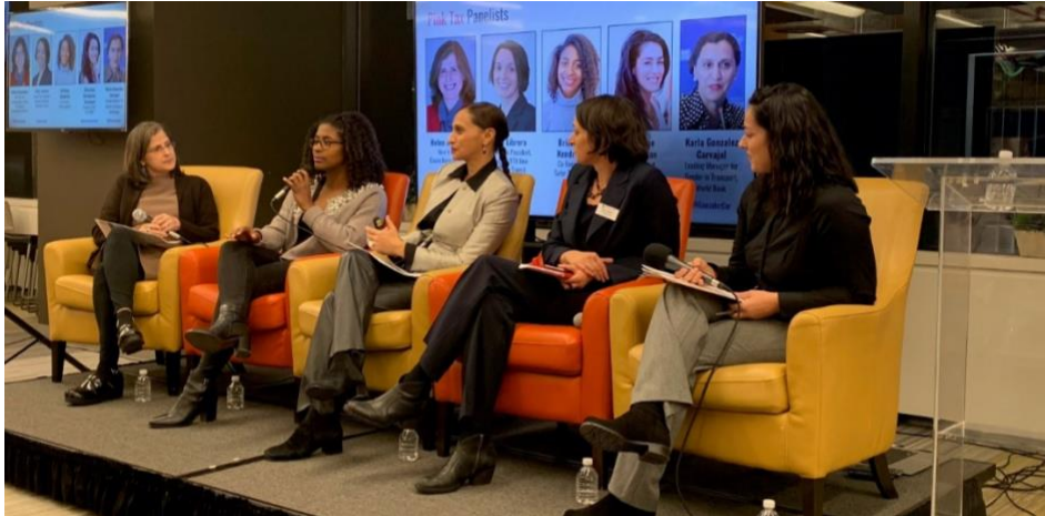
Figure 4: The Pink Tax on Transportation panelists