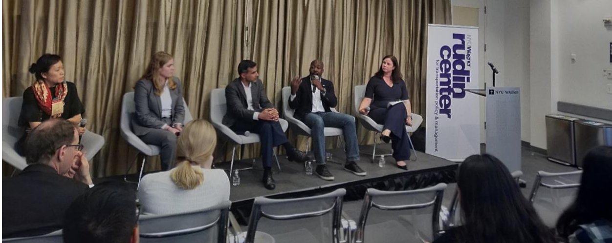
Figure 1: Three Mobility Revolutions panel