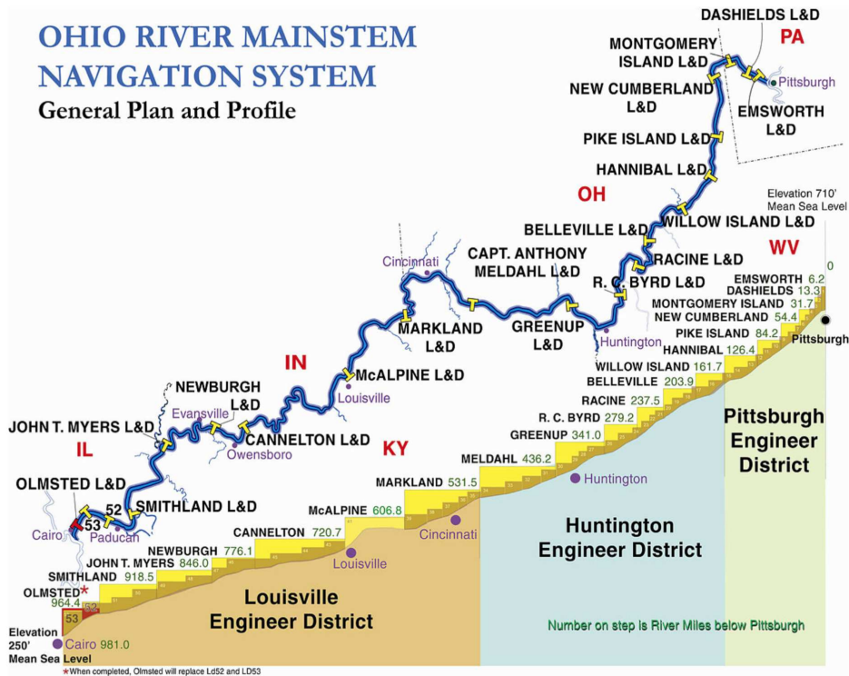
Figure 1: The Ohio River Corridor

The costs of improvement at each lock and dam is formulated in two scenarios, based on a linear function, and a non-linear function with the initial cost, as shown in in the constraints of the formulation earlier. It should be mentioned that different parameters for the C_i^t and V are tested to assess their importance to the robustness of the optimal solution. The mixed integer linear programming model is be solved with Cplex.