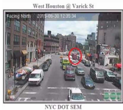
Figure 1. Freight delivery in New York

Capacity and delay models for the effect of individual freight deliveries on traffic were developed using a few different methods. First, observations were collected from New York City DOT traffic cameras and direct observations in Boston (Fig. 1). Second, a simple analytical model was developed by applying methodologies that the 2010 HCM presents for estimating the impacts of bus stops on traffic. Third, a more detailed analytical model was developed based on kinematic wave theory, which is consistent with the dynamics of queuing at intersections and behind delivery vehicles (Fig. 2). These models were then compared to reveal the conditions that the simplified approach provides an appropriate extension of the HCM as well as some important differences that should be accounted for in reality.